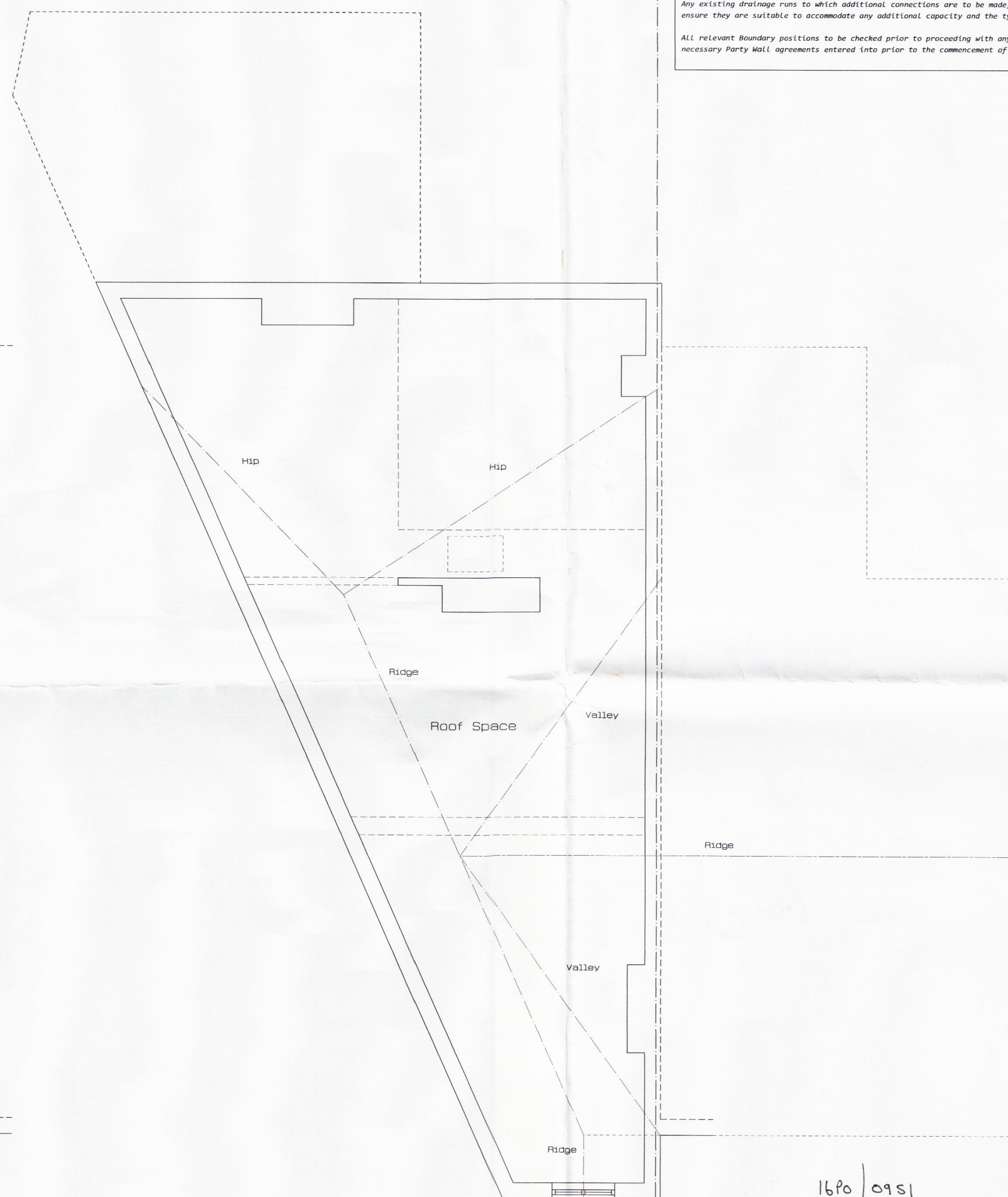
Existing Roof Space

General Notes : Copyright in all documents and drawings prepared by the Architect / Technologist and any works executed from these documents and drawings shall, unless otherwise agreed, remain the property of the Architect / Technologist and must not be reproduced by, lent or disclosed to a third party without the written consent of Building Design Services. Do not scale off this drawing, all dimensions to be checked on site by the Contractor and any discrepancies to be referred back to the Architect / Technologist before proceeding with any work. All Levels to be checked on site by the Contractor and any discrepancies to be referred back to the Architect / Technologist before proceeding with any work. All component sizes and references to be checked with the manufacturer prior to ordering any materials. The positions and designation of any Manholes for Foul, Surface Water or Combined Drainage runs on site to be checked and traced by the Contractor, and confirmed prior to commencement of any new Drainage Works. Any existing drainage runs to which additional connections are to be made, to be checked as necessary to ensure they are suitable to accommodate any additional capacity and the type of effluent being connected. All relevant Boundary positions to be checked prior to proceeding with any Building Works, and all necessary Party Wall agreements entered into prior to the commencement of any construction.