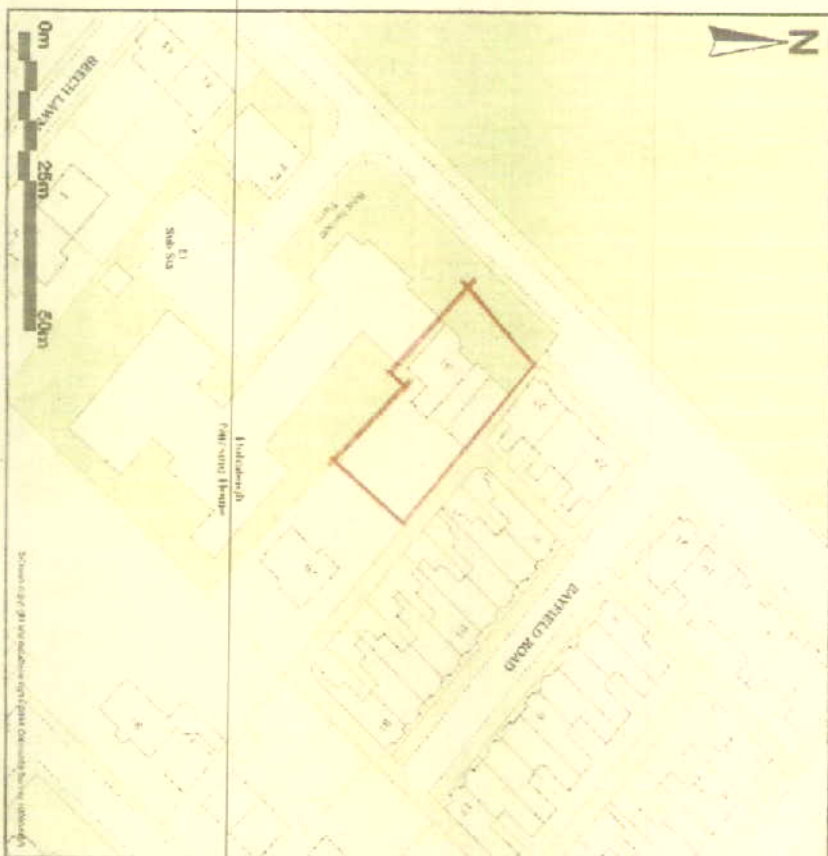
FORMER LOCATION PLAN (Scale 1: 1250)

31 Beechwood Road, Cressington, Liverpool, L19 0LA