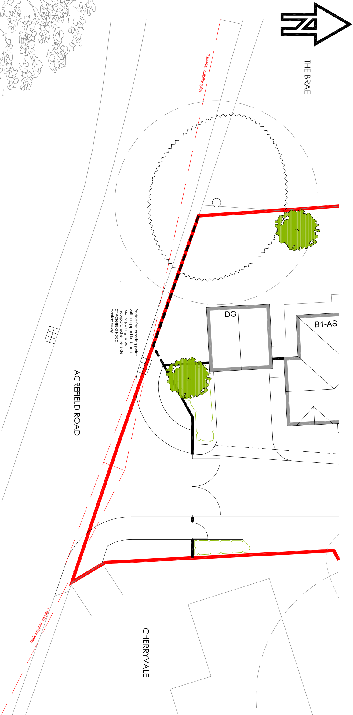
Partial Plan of Access from Acrefield Road 1:200