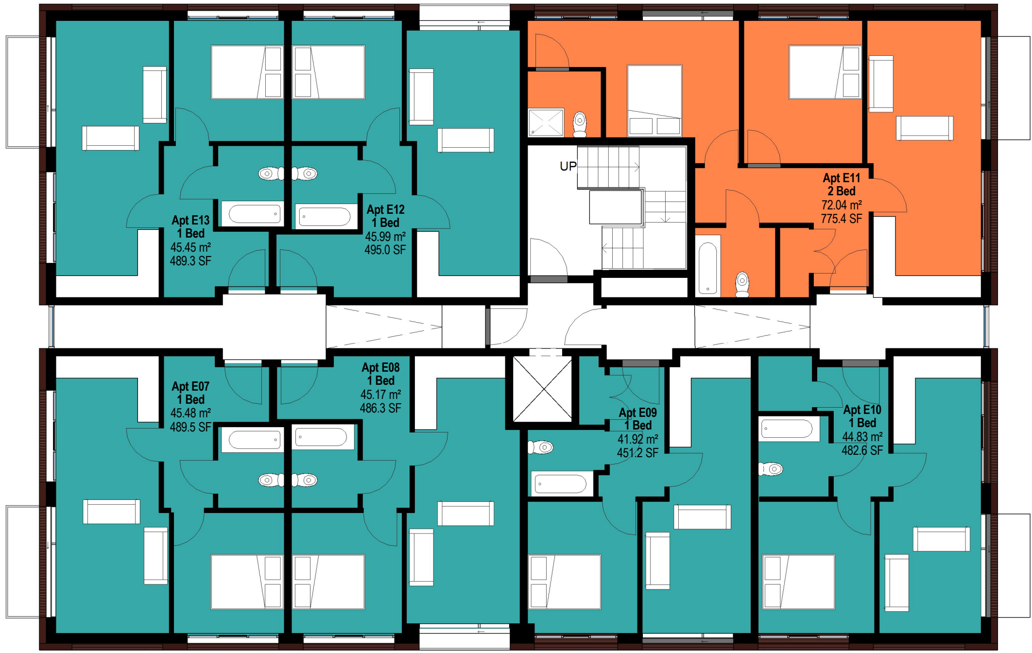
First & Second Floor Plan 1:100