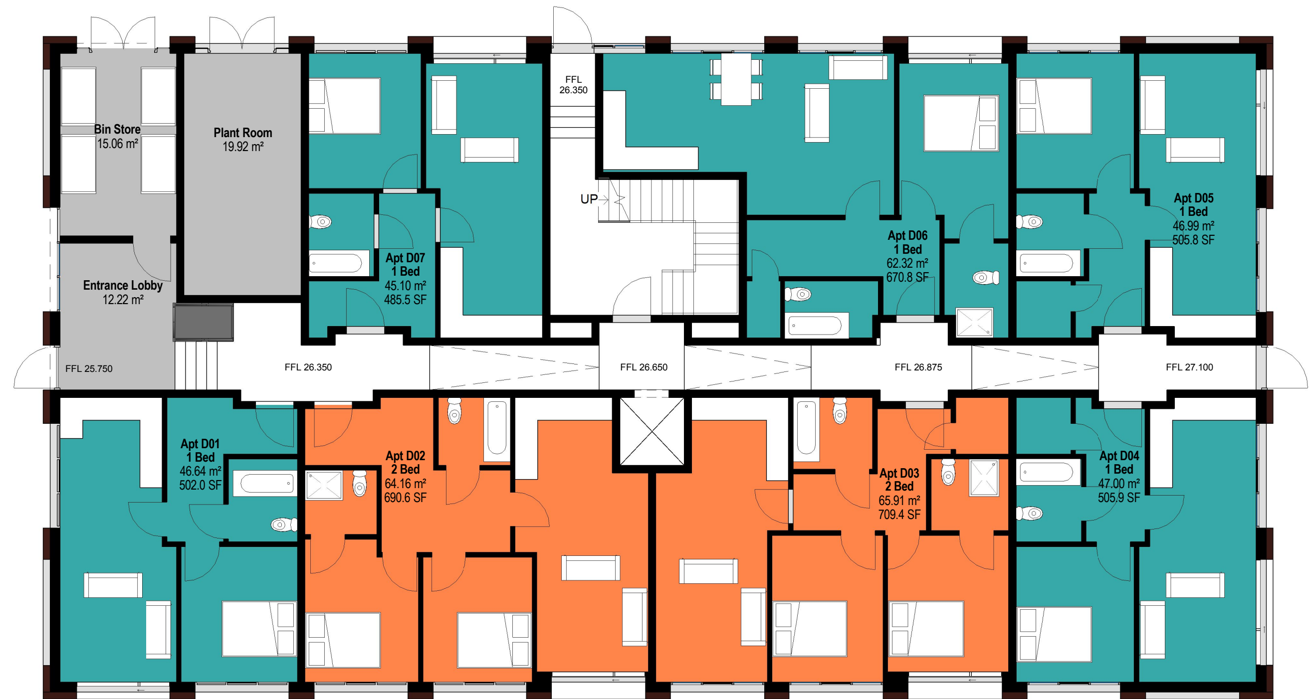
Ground Floor Plan 1:100