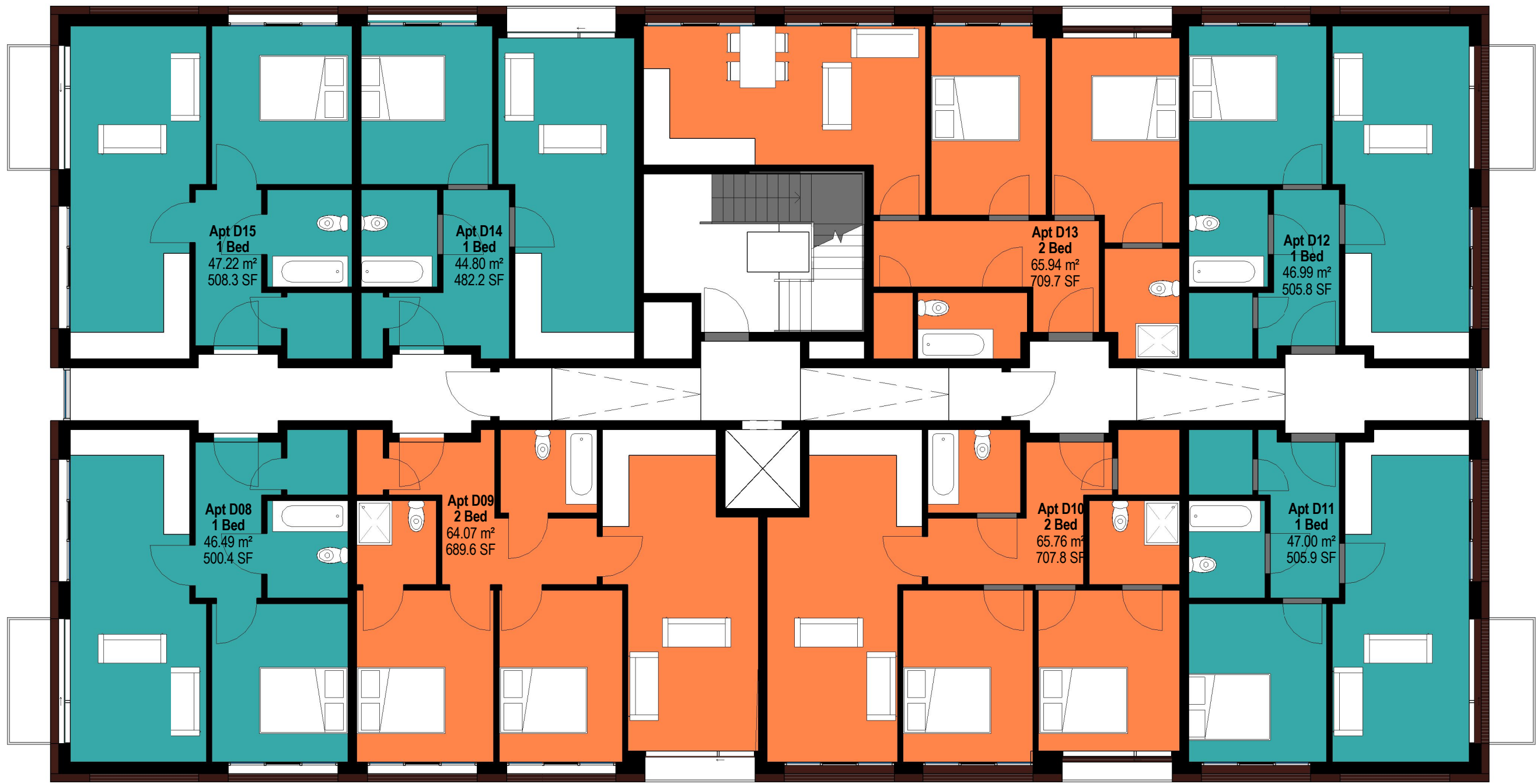
First & Second Floor Plan 1:100