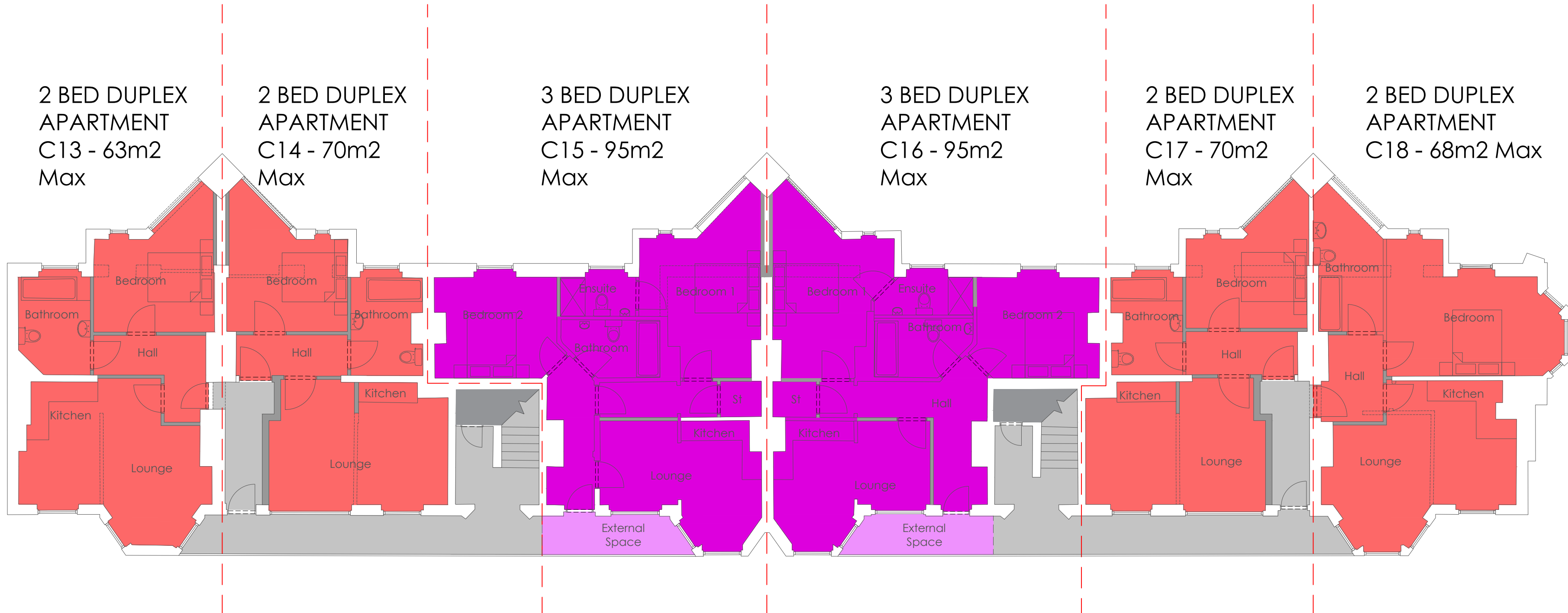
SECOND FLOOR NOTE: LAYOUT OF DUPLEX APARTMENTS TO BE CONFIRMED FOLLOWING COMPLETION OF BUILDING SURVEY - FLOOR ALLOWANCE INCLUDED FOR PLANNING PURPOSES