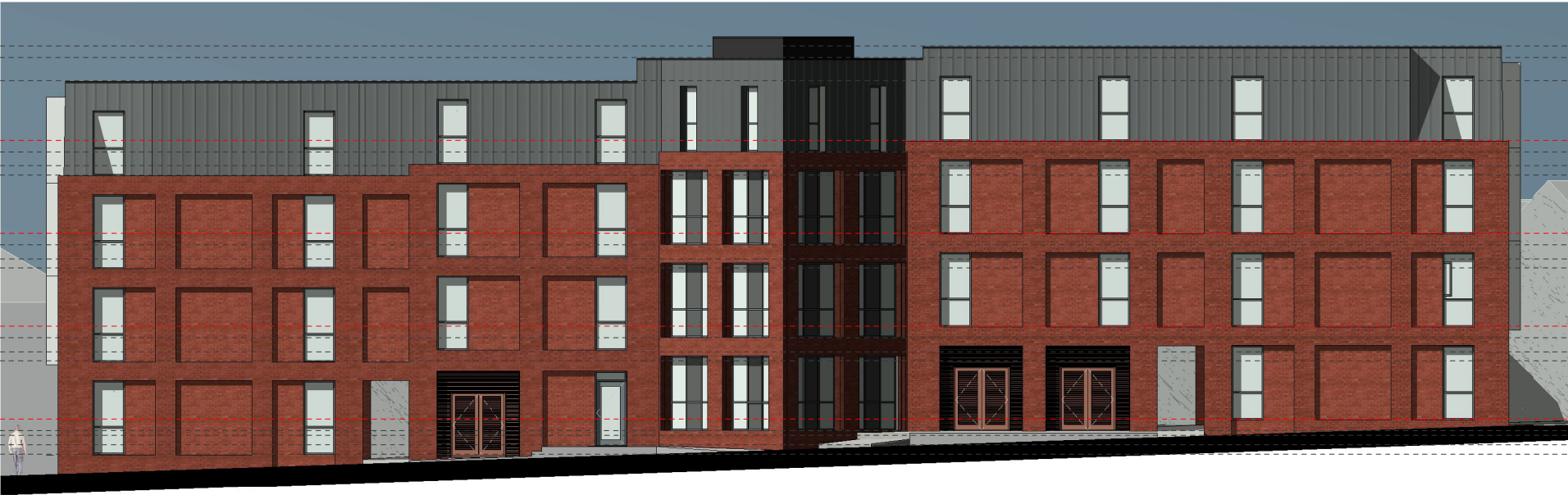
Block H - South Elevation