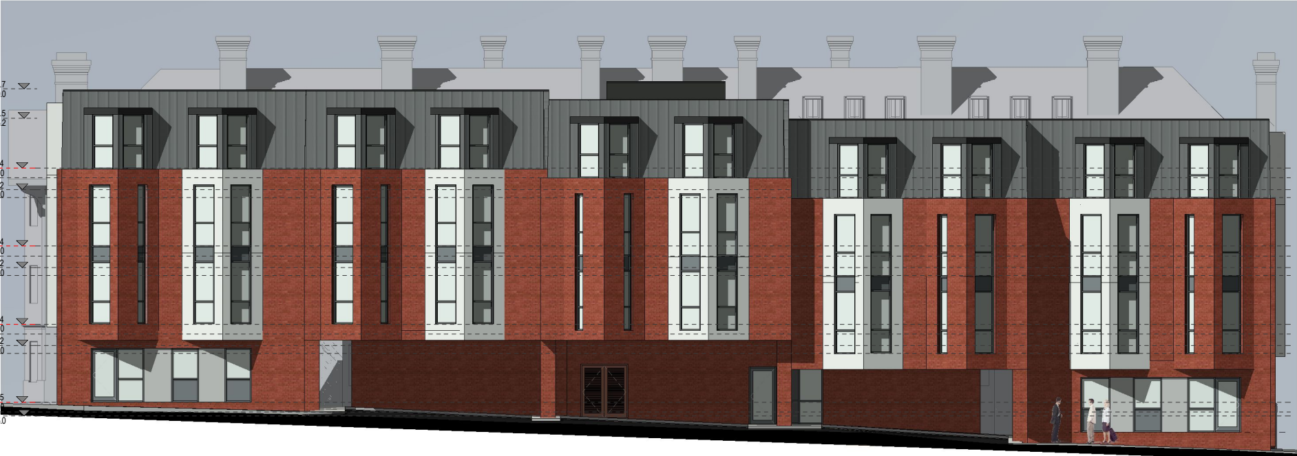
Block H - North Elevation