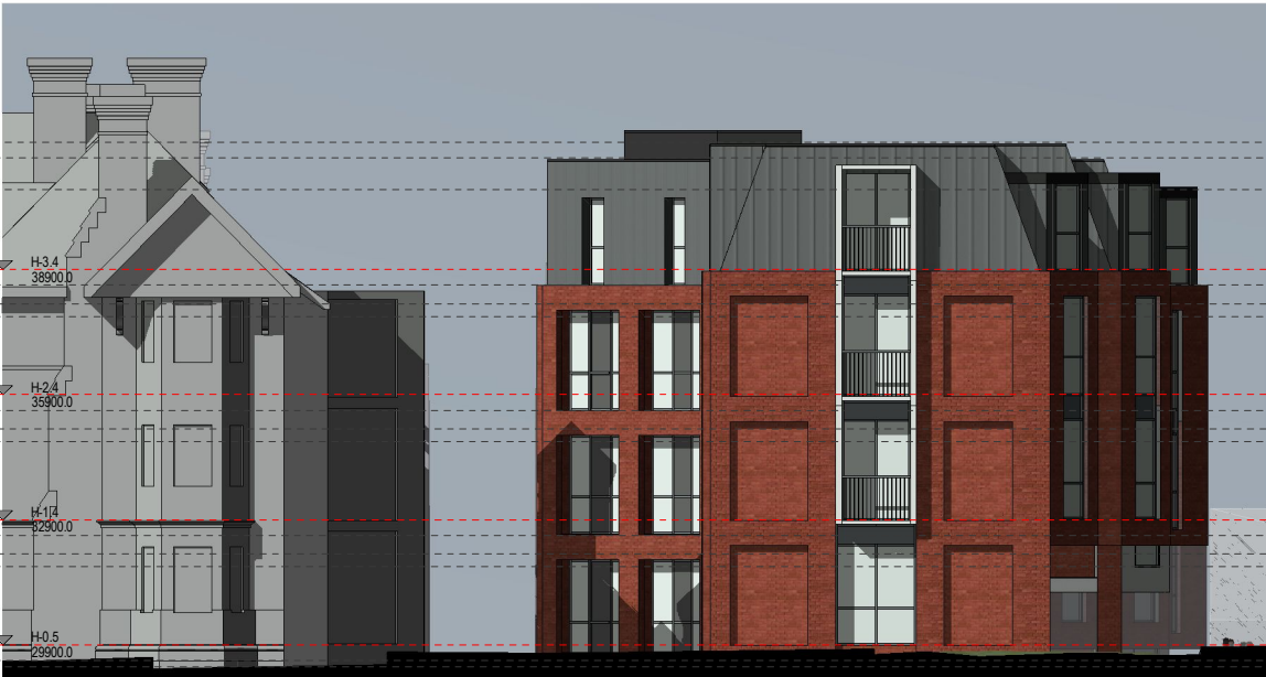
Block H - East Elevation