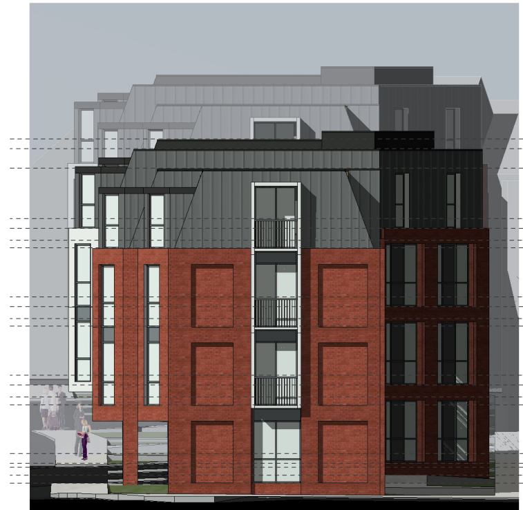
Block F - West Elevation

F-R3 39475.0 F-R2 39100.2 F-R1 38350.2 F-3.4 36425.0 F-3.3 36050.0 F-3.2 35600.0 F-3.1 35300.0 F-2.4 33425.0 F-2.3 33050.0 F-2.2 32600.0 F-2.1 32300.0 F-1.4 30425.0 F-1.3 30050.0 F-1.2 29600.0 F-1.1 29300.0 F-0.5 27425.0 F-0.4 27050.0 F-0.3 26900.0 F-0.2 26600.0 F-0.1 26300.0