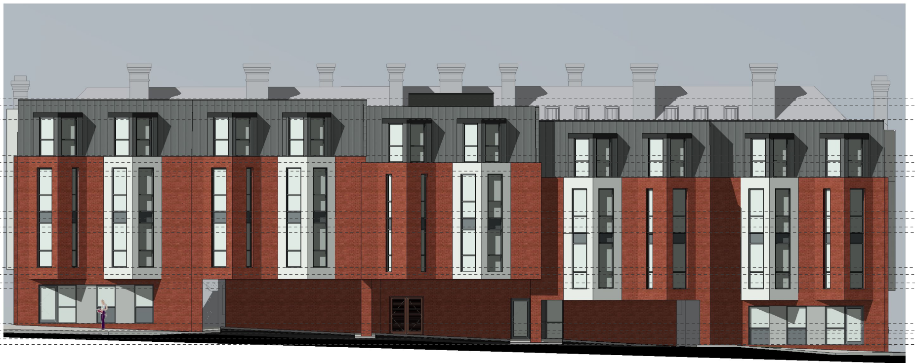
Block F - North Elevation

F-R3 39475.0 F-R2 39100.2 F-R1 38350.2 F-3.4 36425.0 F-3.3 36050.0 F-3.2 35600.0 F-3.1 35300.0 F-2.4 33425.0 F-2.3 33050.0 F-2.2 32600.0 F-2.1 32300.0 F-1.4 30425.0 F-1.3 30050.0 F-1.2 29600.0 F-1.1 29300.0 F-0.5 27425.0 F-0.4 27050.0 F-0.3 26900.0 F-0.2 26600.0 F-0.1 26300.0