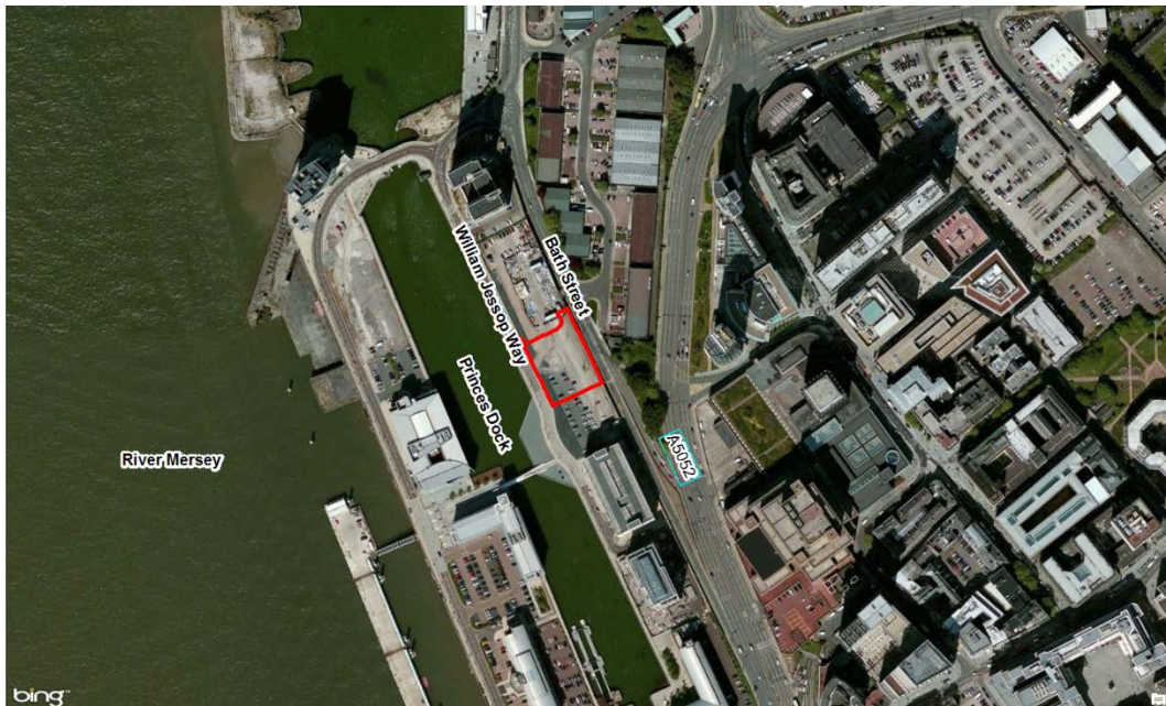
Figure 1.1: Site location of Princes Reach, Liverpool. Site boundary denoted by red line.

It is proposed that the existing site is developed into a private rented sector residential building of up to 375 units.