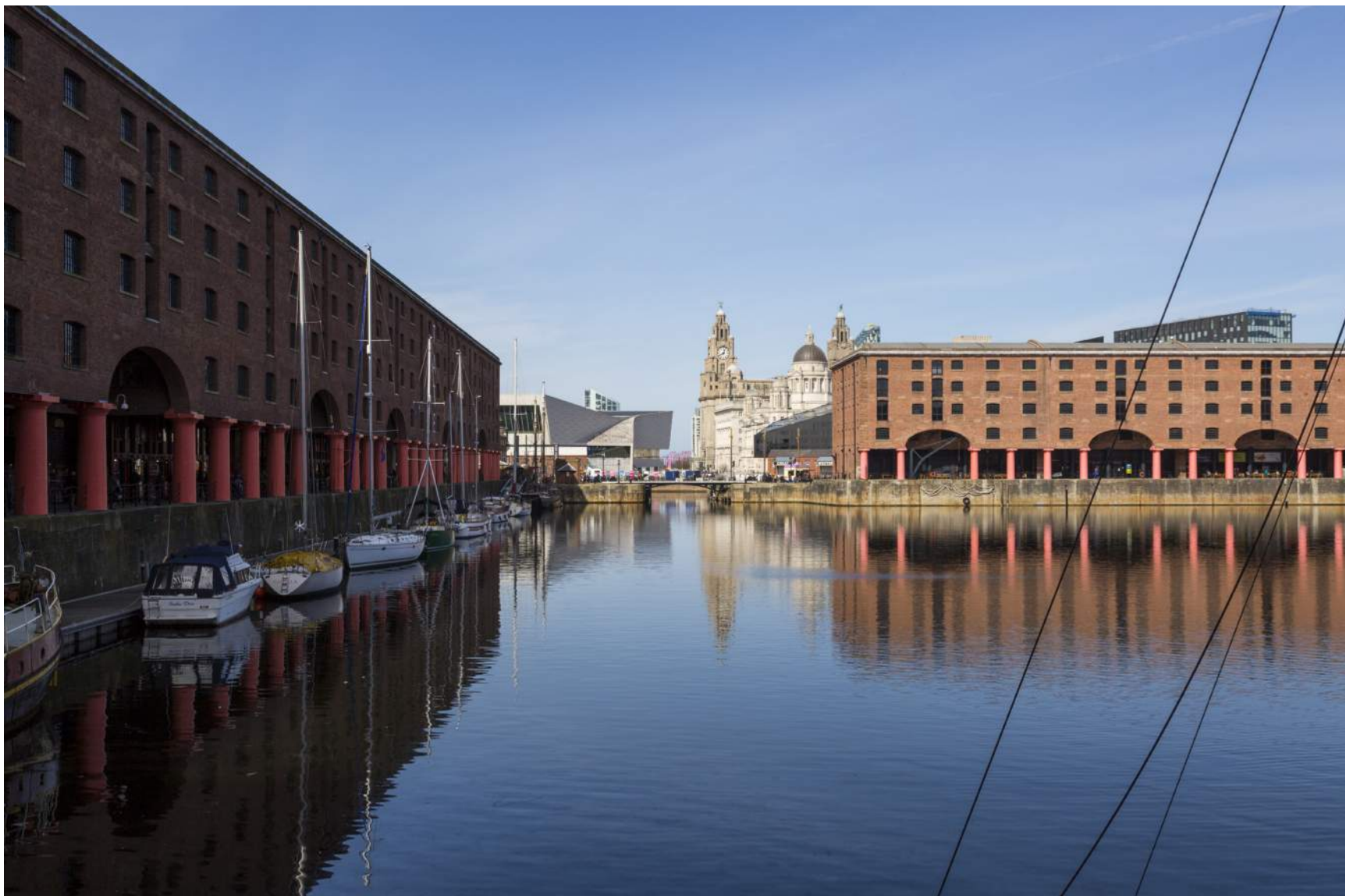
Princes Reach TVIA View 7: Albert Dock- SW corner infront of What's Cooking - Existing