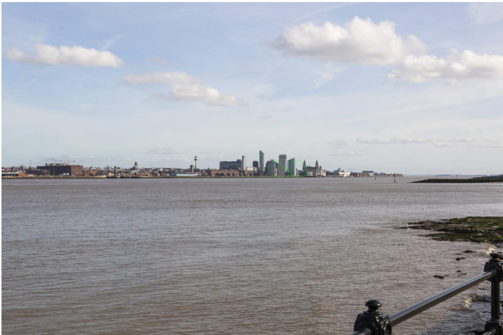
Princes Reach TVIA View 1: Magazine Parade, in front of entrance to Vale Park - Proposed with emerging