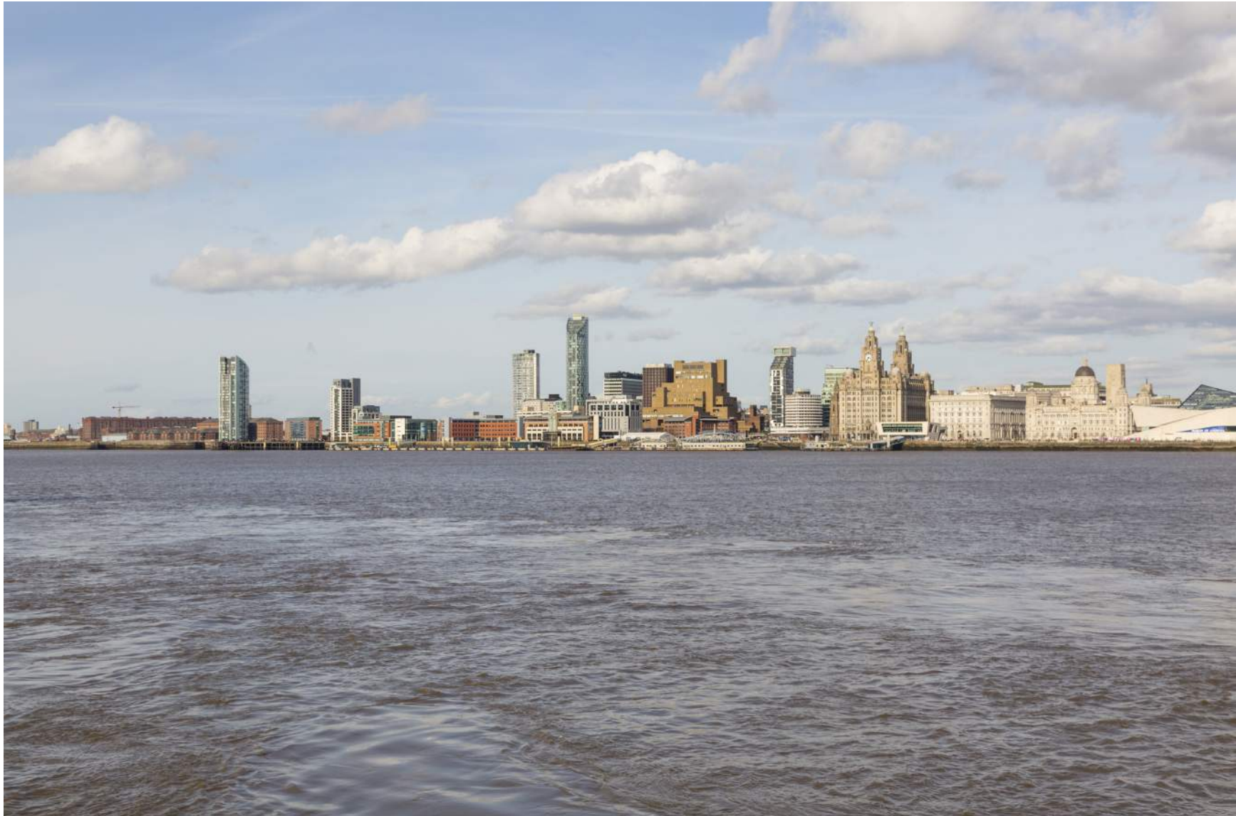
Princes Reach TVIA View 3: Birkenhead Ferry Landing - Existing