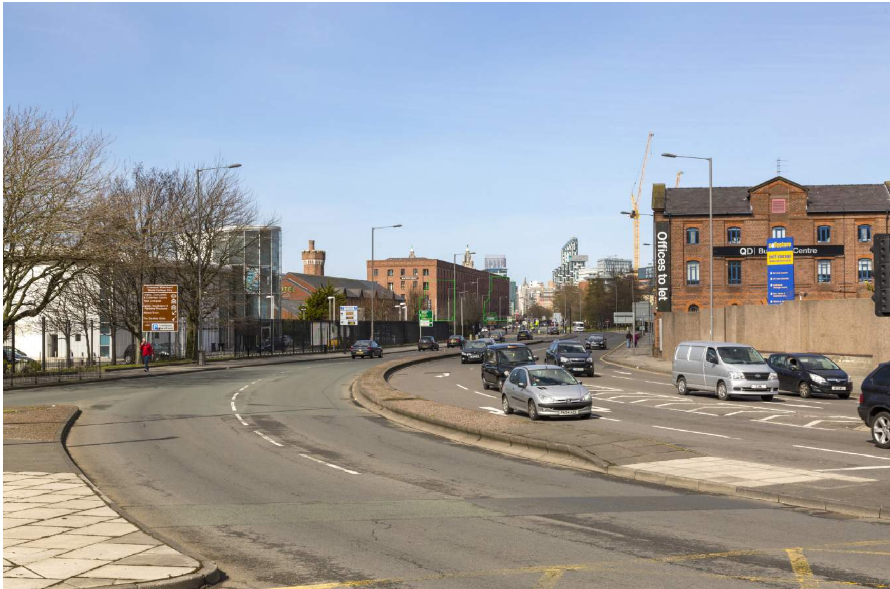
Princes Reach TVIA View 5: Parliament Street/ Chaloner Street - Proposed with emerging