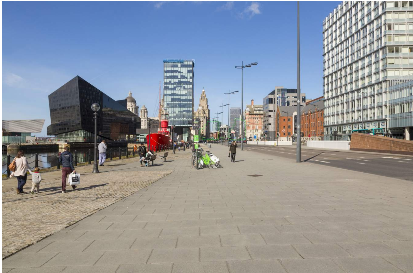
Princes Reach TVIA View 8: Albert Dock- in front of the entrance on the strand - Proposed with emerging