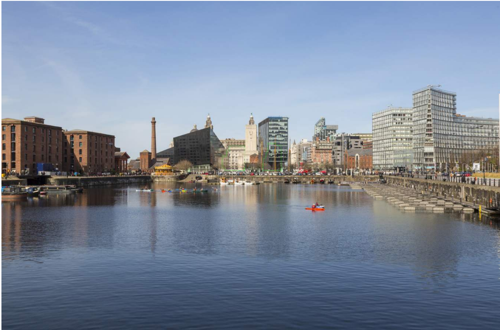
Princes Reach TVIA View 9: Albert Dock - Wapping/Gower Street corner - Proposed with emerging