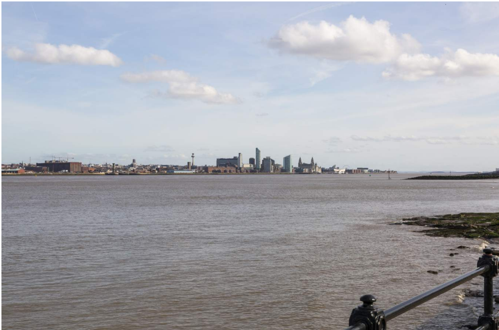
Princes Reach TVIA View 1: Magazine Parade, in front of entrance to Vale Park - Existing