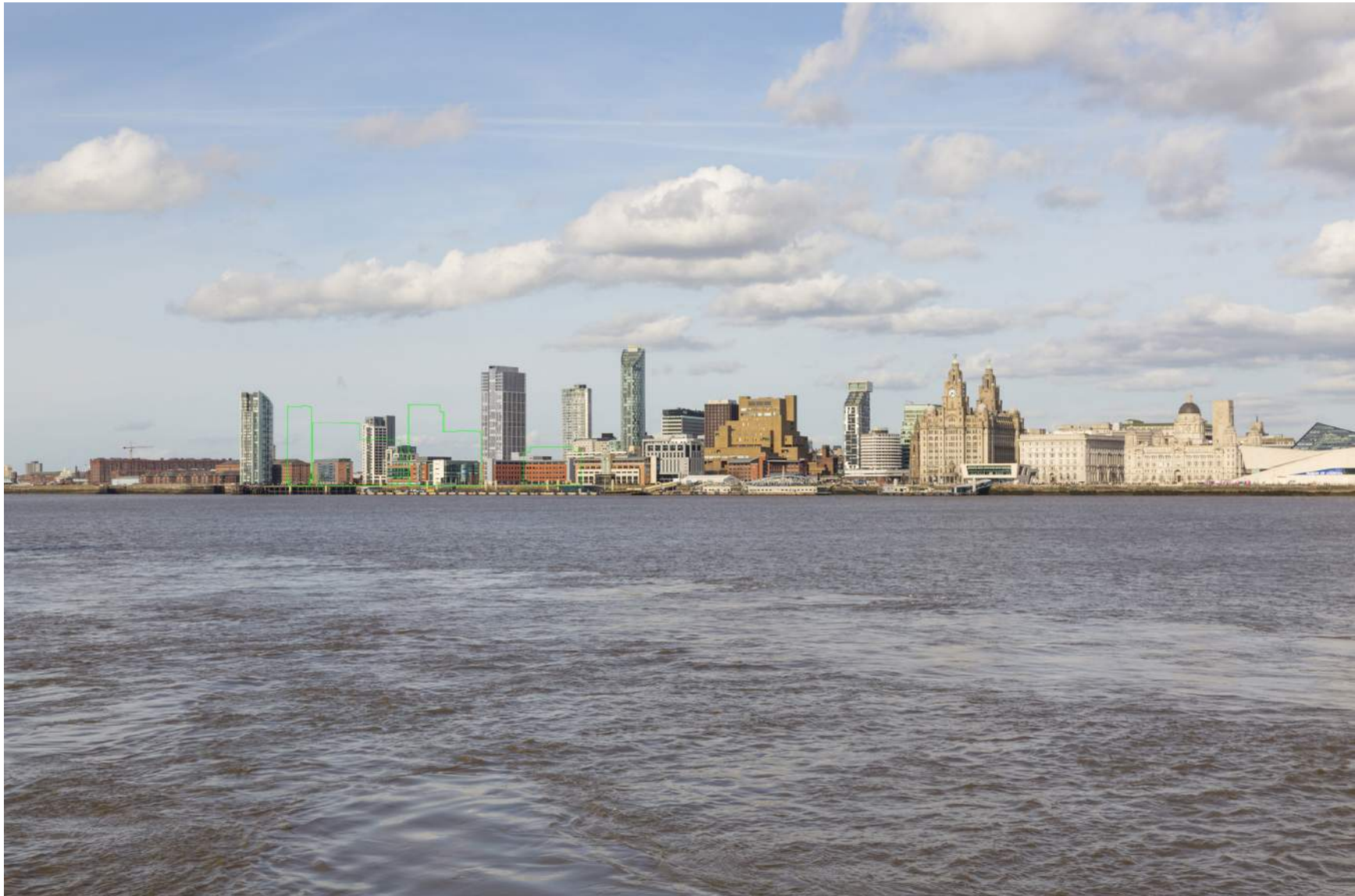
Princes Reach TVIA View 3: Birkenhead Ferry Landing - Proposed with emerging