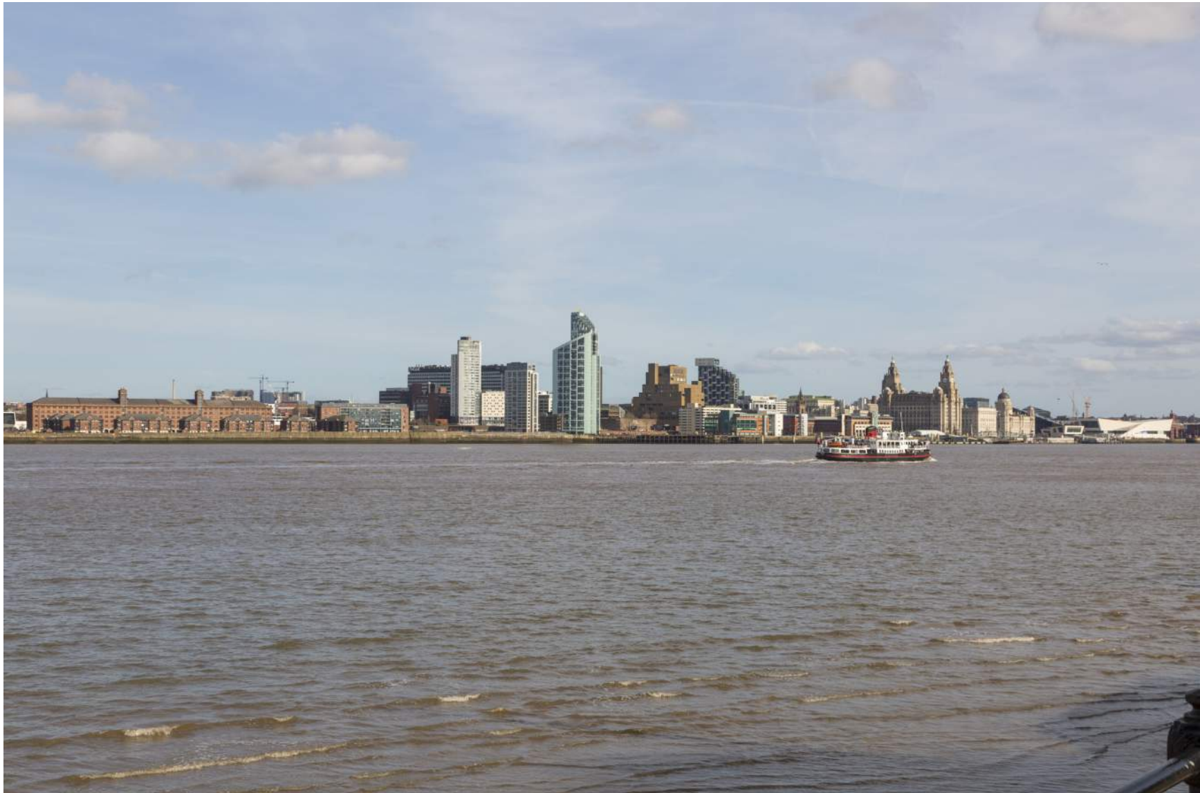
Princes Reach TVIA View 2: Wallasey Town Hall, bottom of steps up to the Town Hall - Existing