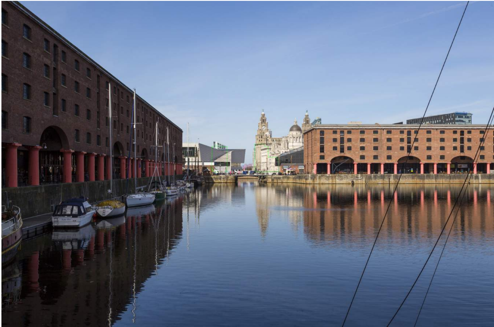
Princes Reach TVIA View 7: Albert Dock- SW corner infront of What's Cooking - Proposed with emerging