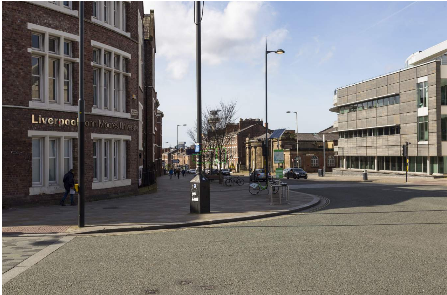
Princes Reach TVIA View 6: Hope Street/ Mount Pleasant - Proposed with emerging