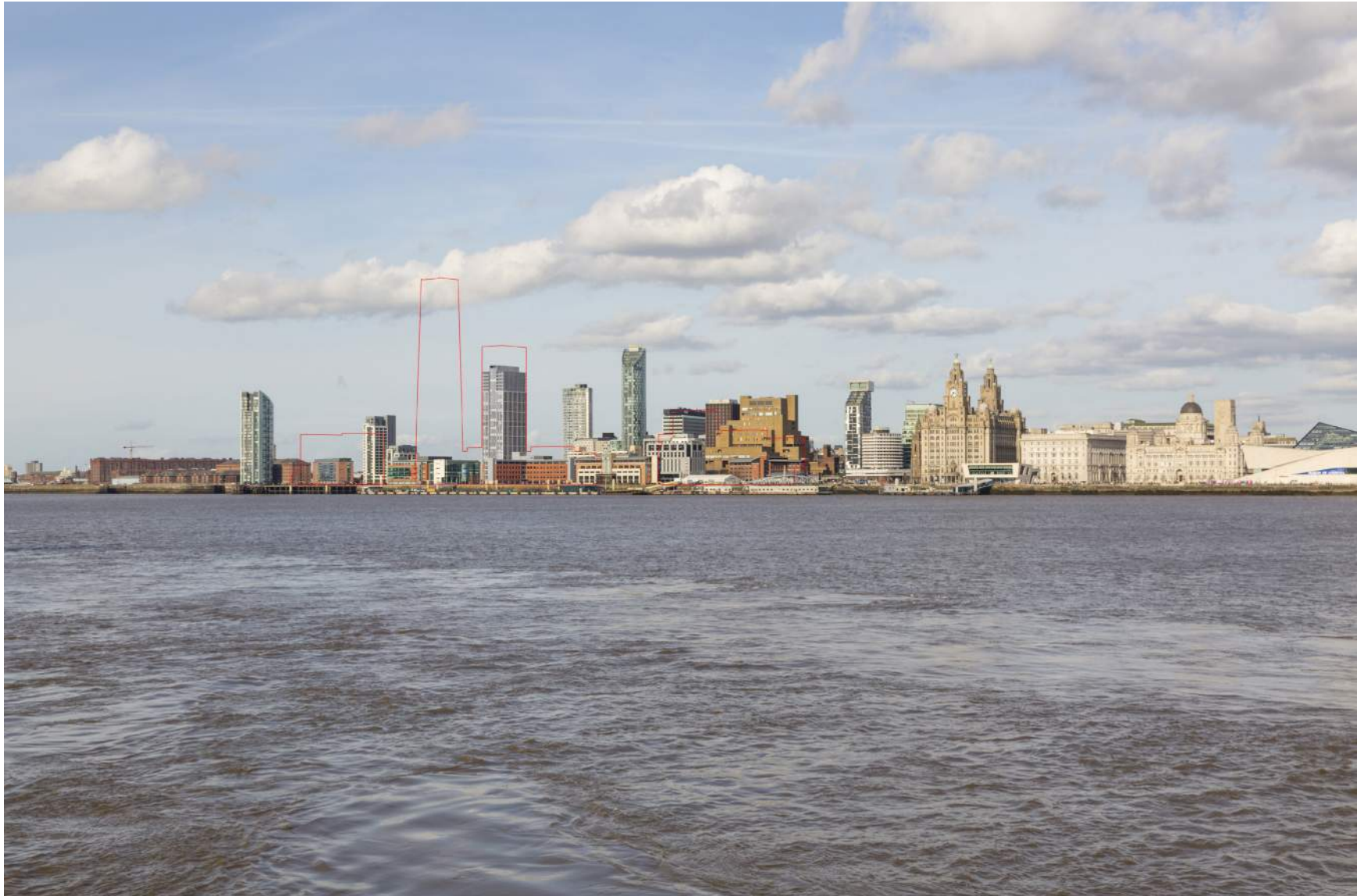
Princes Reach TVIA View 3: Birkenhead Ferry Landing - Proposed with parameters