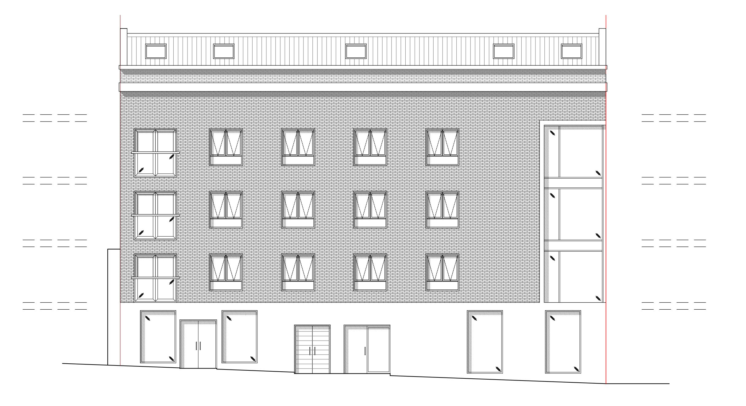
PROPOSED NORTH ELEVATION 1:100