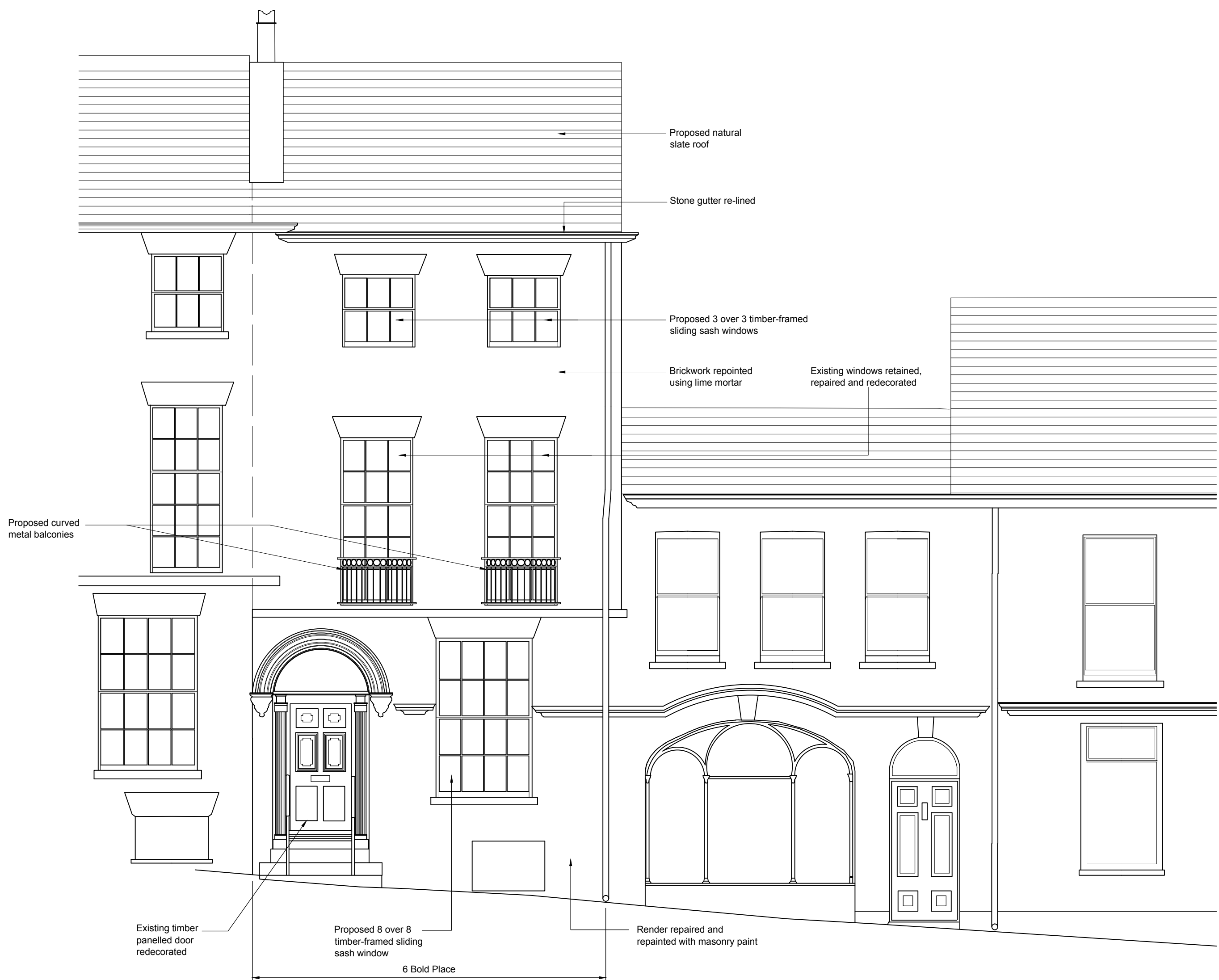
Proposed Front Elevation (Scale 1:50)