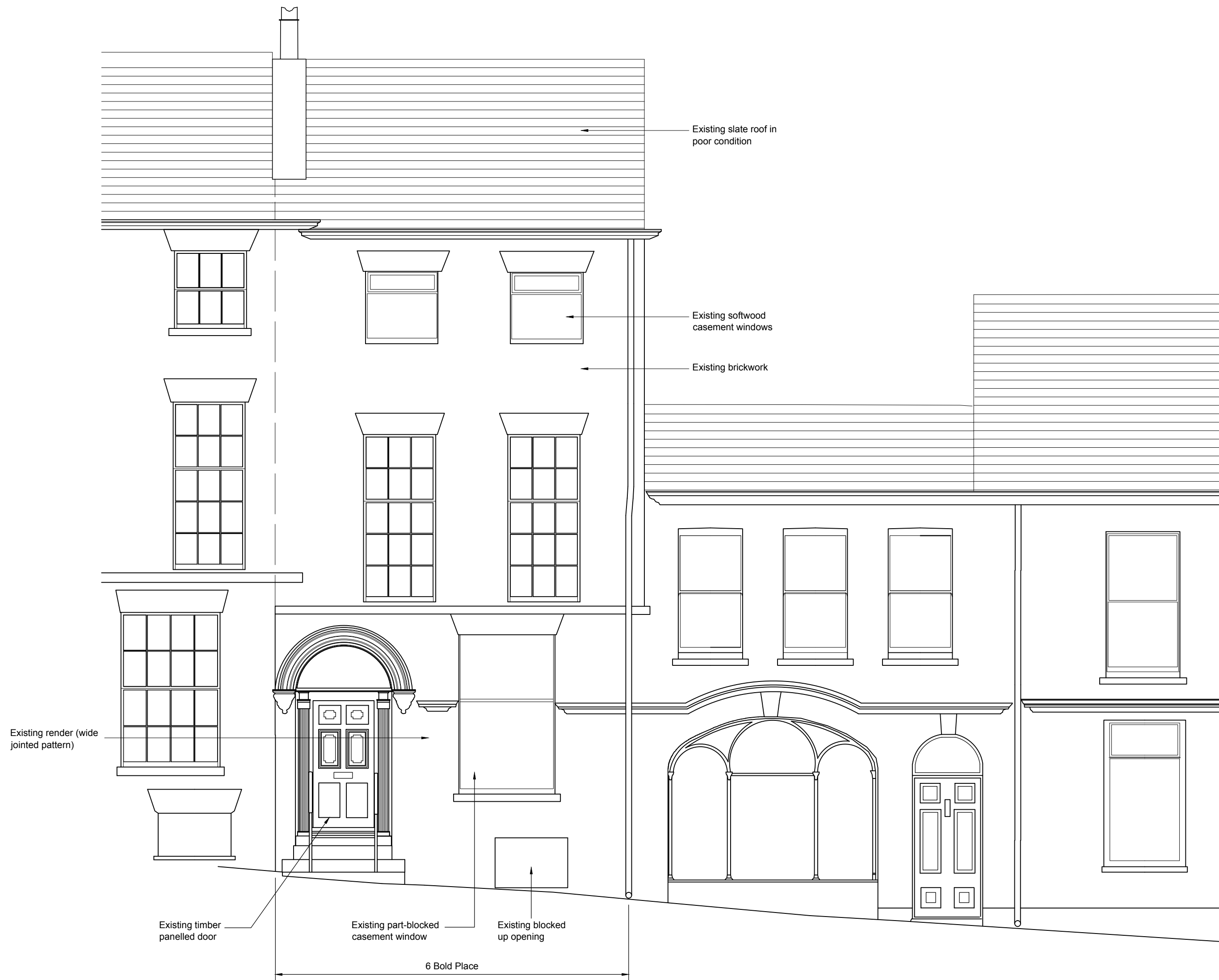
Existing Front Elevation (Scale 1:50)