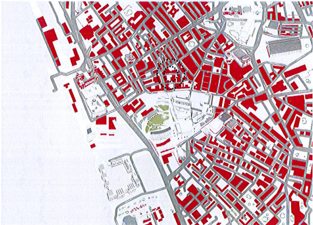
Figure 1: Proposed location on Mathew Street

This application seeks planning permission to install a statue of Cilla Black on Mathew Street, outside the iconic Cavern Club where Cilla started out as a cloakroom girl and later performed there on stage on her road to stardom.