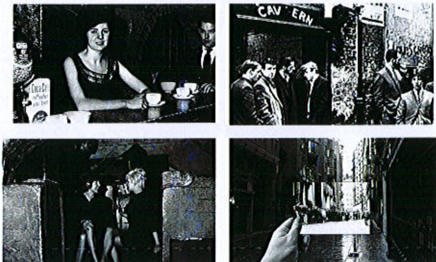
Figure 2: Images of Cilla Black and in the Cavern Club in the early 1960's

It is important that public art projects are site-specific and respond to the context of their location. Locating the statue of Cilla here, close to the original entrance to the Cavern Club with the historic information panel on the opposite side of Mathew Street, provides the perfect context for her as a singer. It also links to the strong music heritage of Liverpool which is being promoted through the recent designation of Liverpool as a UNESCO City of Music and to the imminent opening of 'The British Music Experience' museum which will be housed in the ground floor of the Cunard Building.