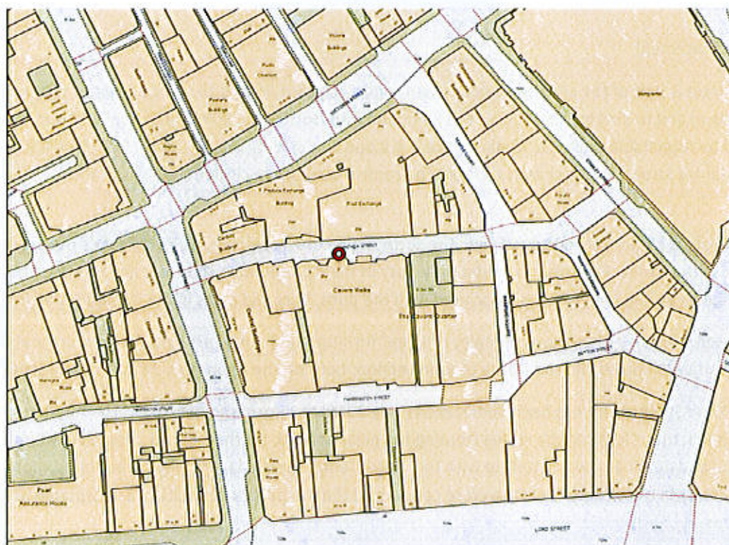
Figure 6: Detailed location of statue

Cavern Walks is a boutique arcade comprising a collection of independent retailers and designer brands including Cricket, Vivienne Westwood, Boudoir Boutique, Weavers Door and Lola Loves. Cavern Walks also has an entrance onto Harrington Street. The statue will not obstruct access to Cavern Walks from Mathew Street.