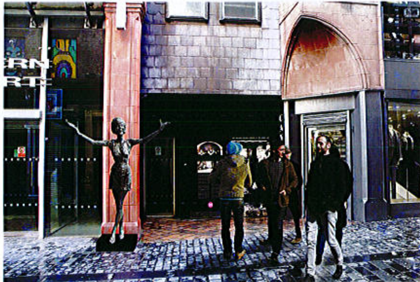
Figure 4: Illustration of the statue in position – looking towards the original Cavern entrance (©Emma Rogers)

The images below illustrate how the statue will look in position (note: plinth detailing will differ from what is illustrated).