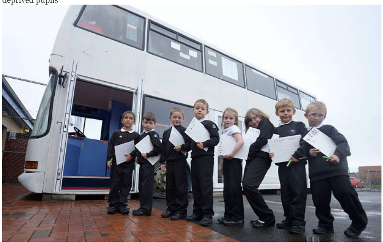
The double-decker cost £5,000 on Ebay and £3,000 to do up.

The £8,000 bus has been kitted out with internet, electricity and heating for extra reading and writing sessions for deprived pupils