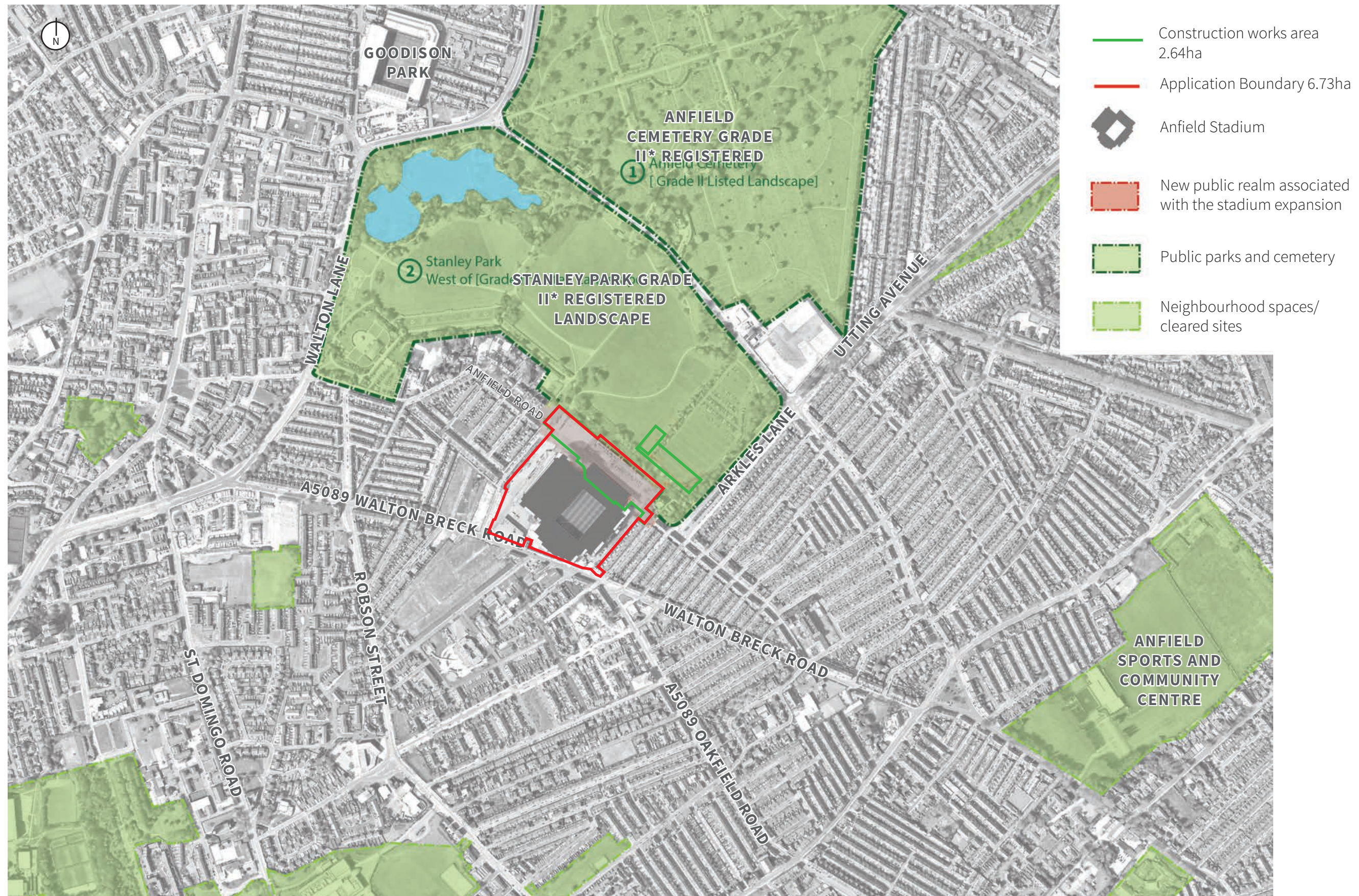
Figure 7.7 Public Open Space