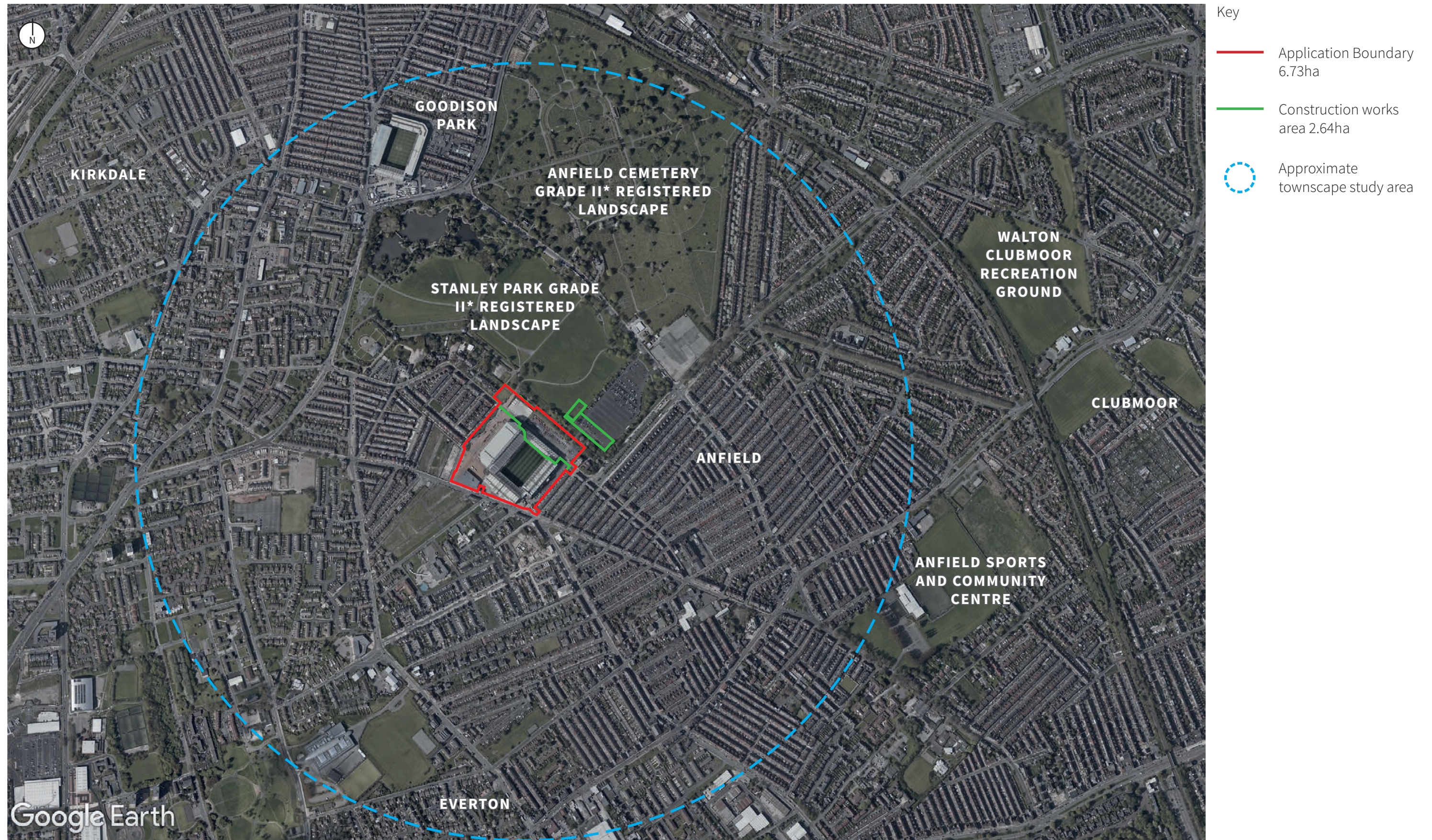
Figure 7.1 Site location plan /Townscape Study Area