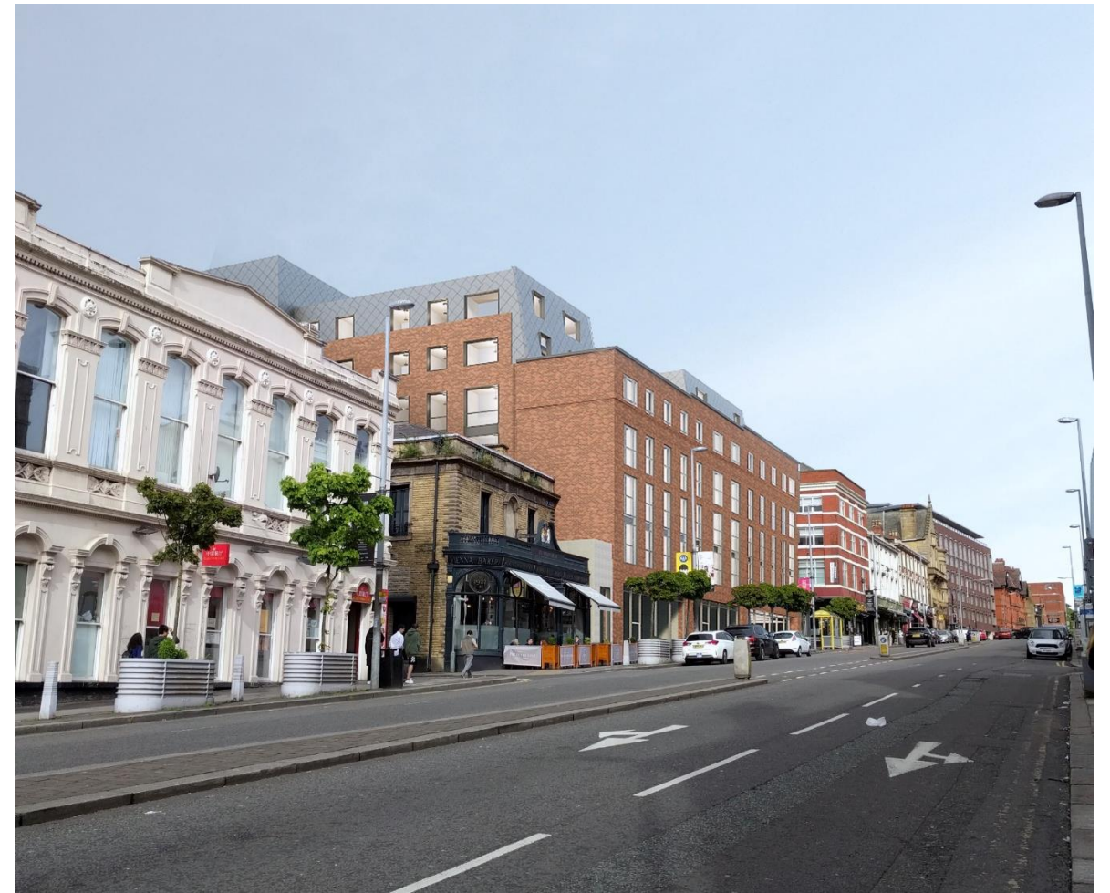
Proposed views Hardman Street