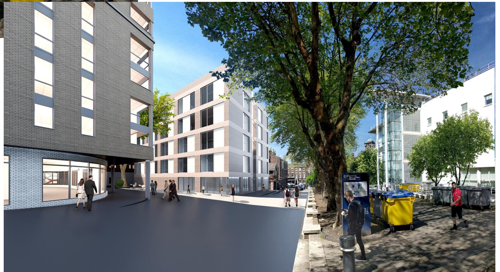
Proposed view Maryland Street