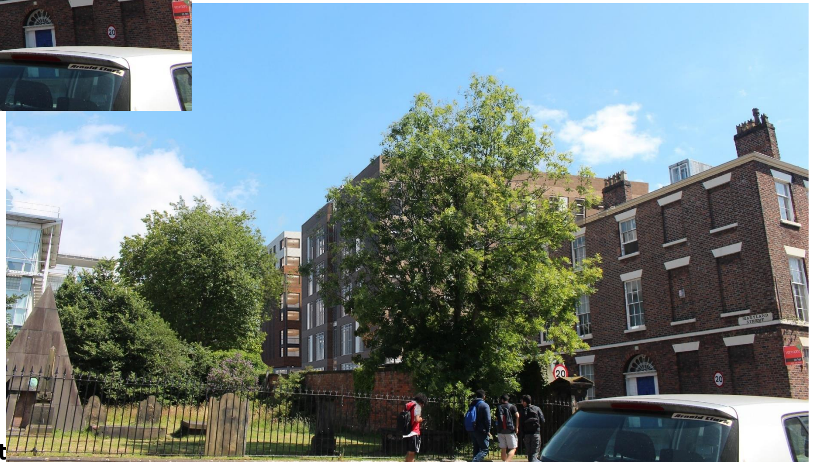
Proposed view from Rodney Street