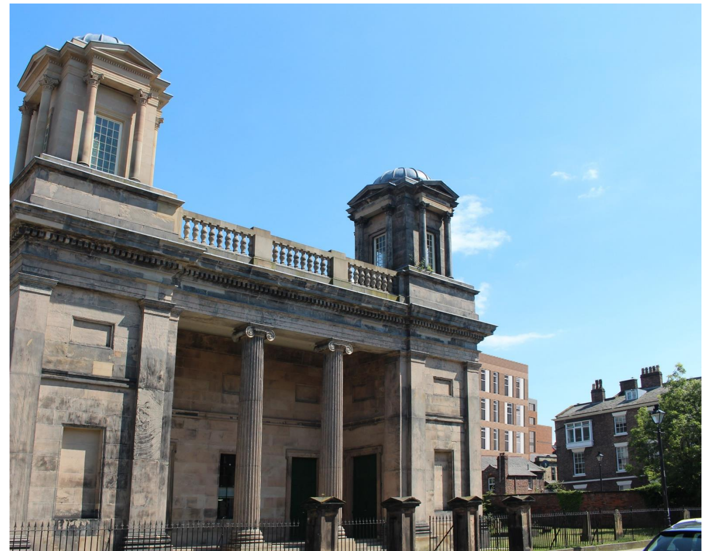
Proposed view from Rodney Street