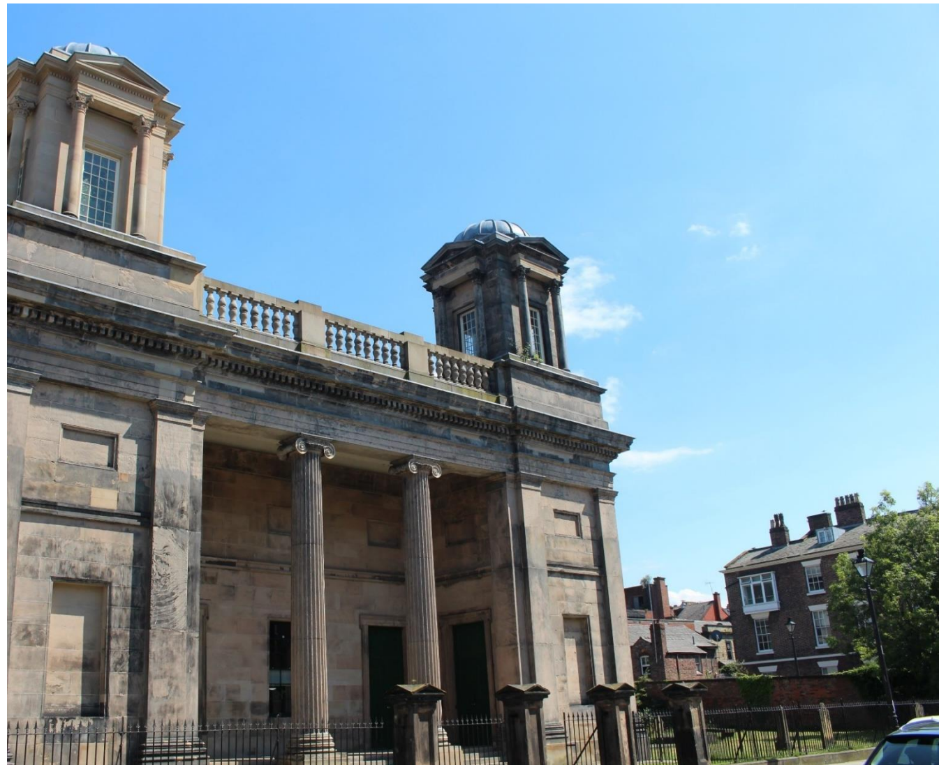
Existing view from Rodney Street