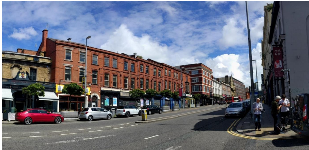
Existing view Hardman Street