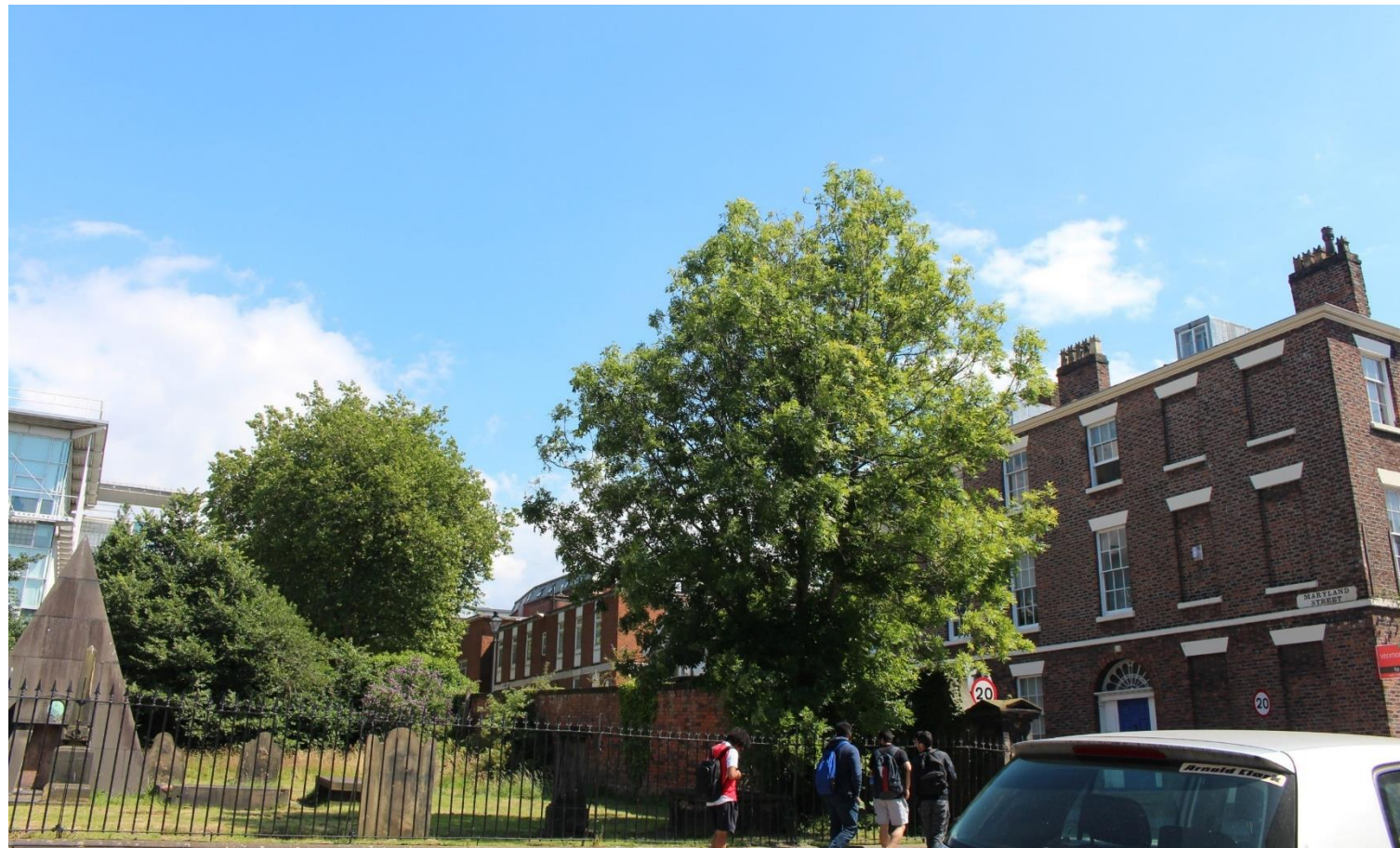
Existing view from Rodney Street