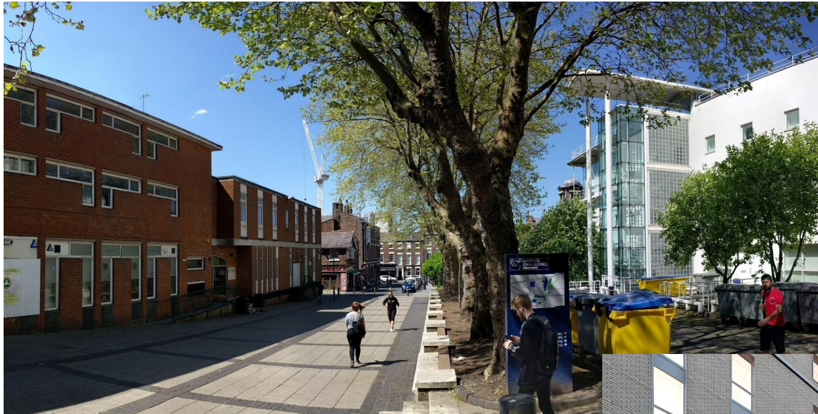
Existing view Maryland Street