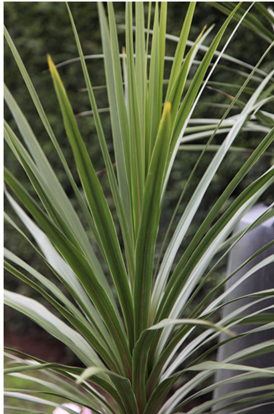
Plant seven – Ophiopogon Planiscapus ‘Nigrescens’ (Black Mondo)