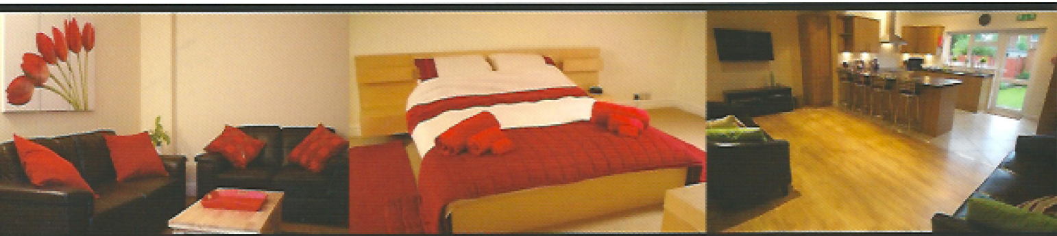
BEAUTIFUL ROOMS TO RENT