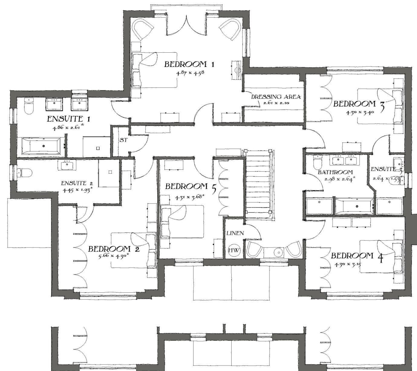
First Floor Layout