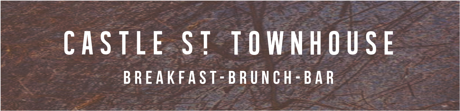
Distressed steel sign, with inlaid acrylic lettering. Internal illumination provided by white leds.