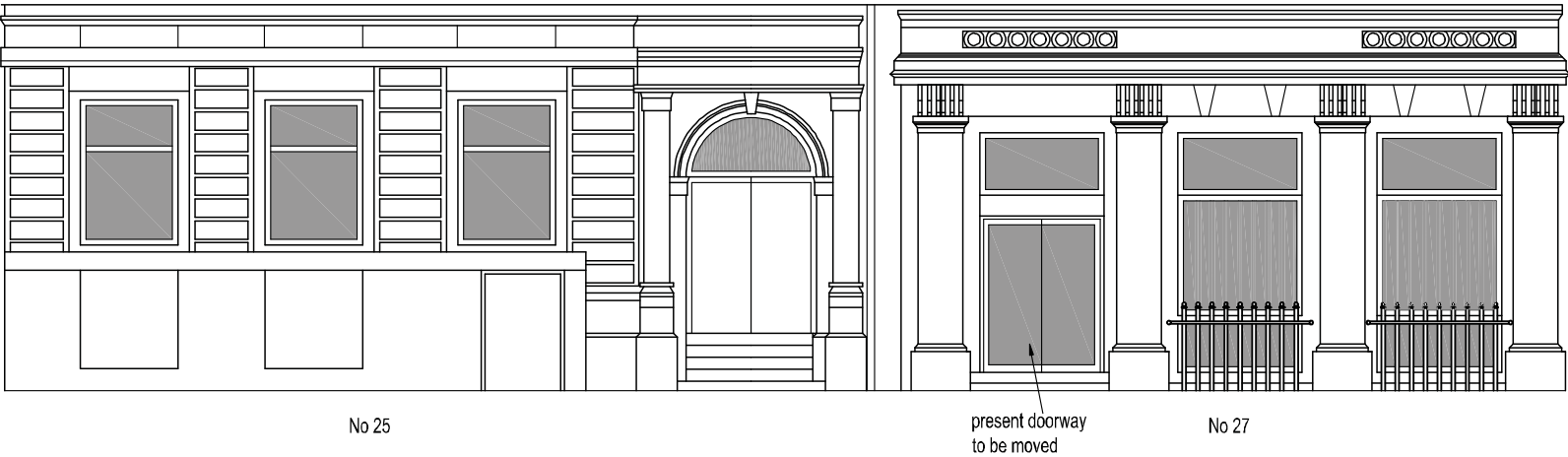
Existing Castle Street Elevation