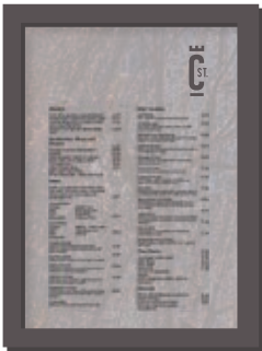
A3 illuminated menu case