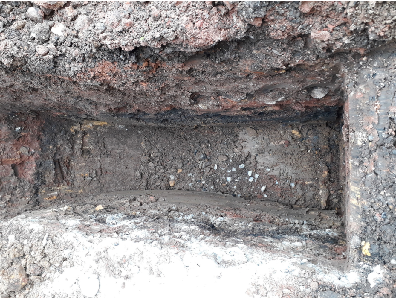
TP03 Pit Bottom