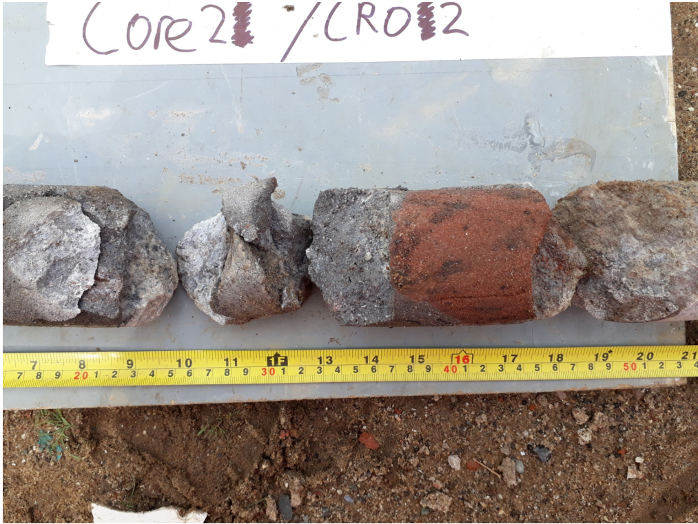
Core 02 close up 2