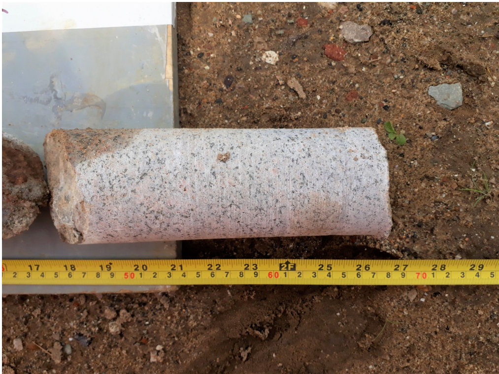
Core 02 close up 3