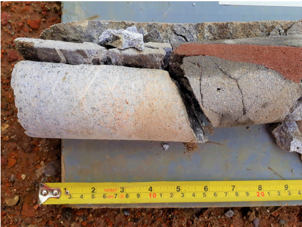
Core 03 close up 1

GINT LIBRARY V8 07.GLB LibVersion: v8.07.001 PriVersion: v8.07 | Log GENERAL LOG - A4P | 764954 - BRAMLEY MOORE DOCK WALL.GPJ - v8.07. Structural Soils Ltd, Branch Office - Castleford, The Potteries, Pottery Street, Castleford, West Yorkshire, WF10 1NJ. Tel: 01977-552255, Fax: 01977-552259, Web: www.soils.co.uk, Email: ask@soils.co.uk | 28/10/19 - 15:02 | MG1 |