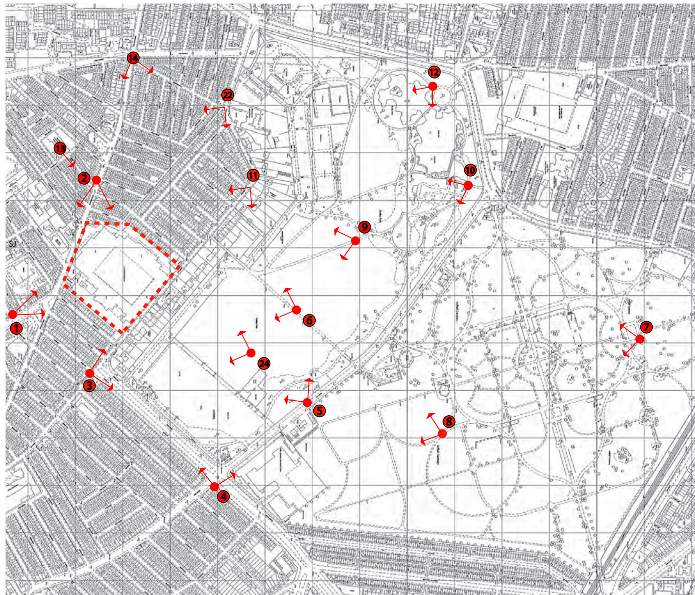
Principal Viewpoints (Surrounding)