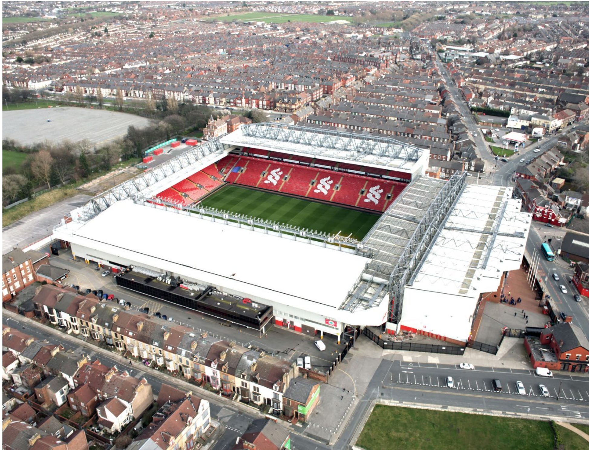
Aerial photograph of the existing stadium