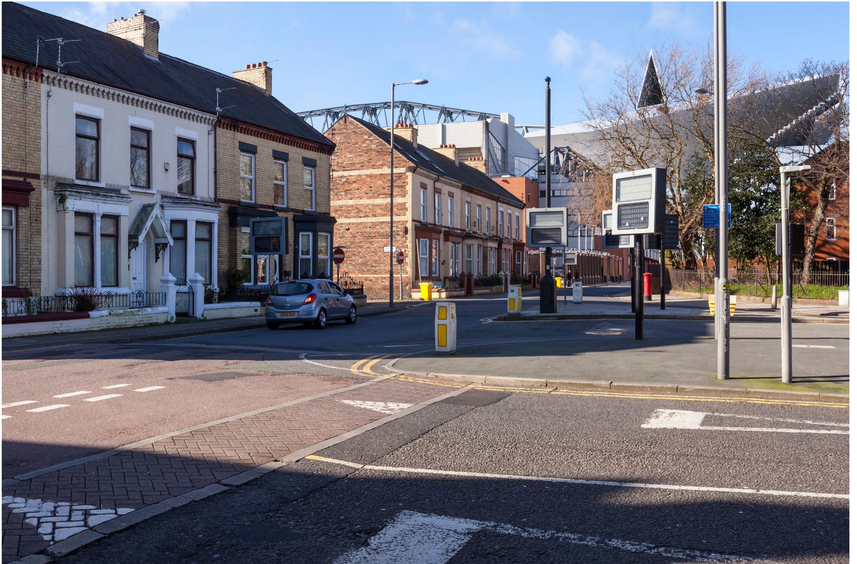
VIEW03 - PROPOSED PHASE 2