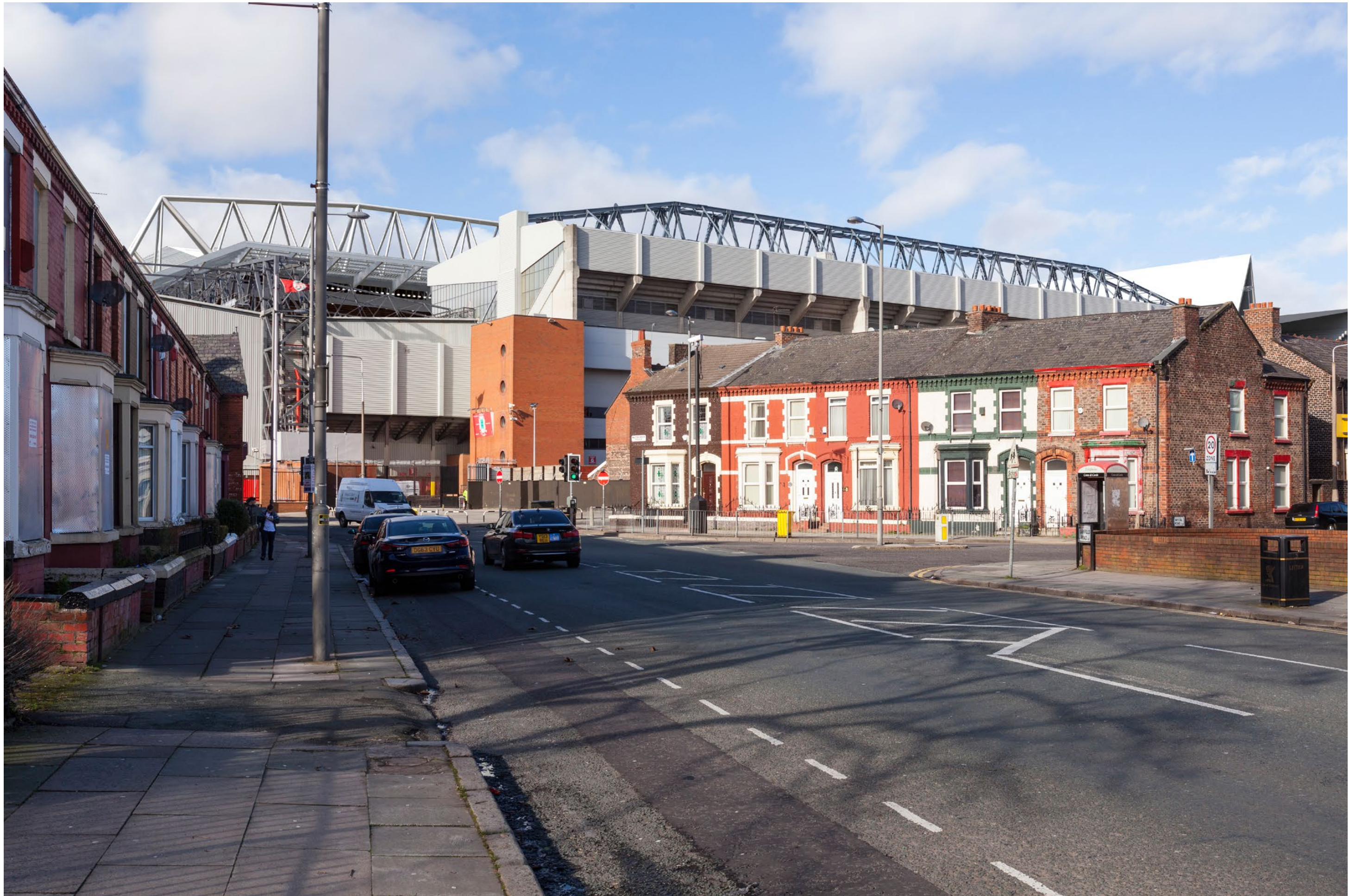
VIEW01 - PROPOSED PHASE 2