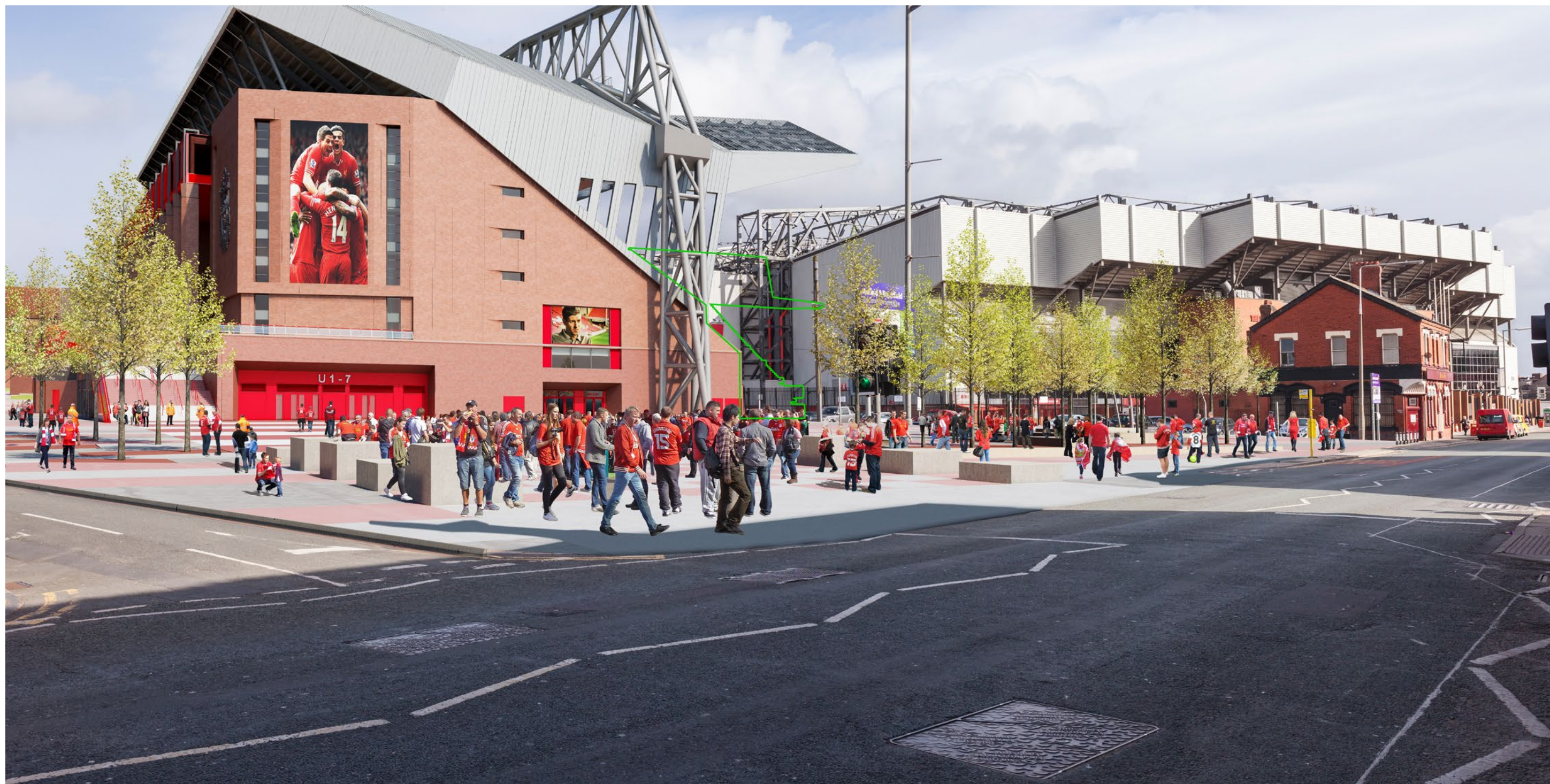
VIEW02 - PROPOSED PHASE 2