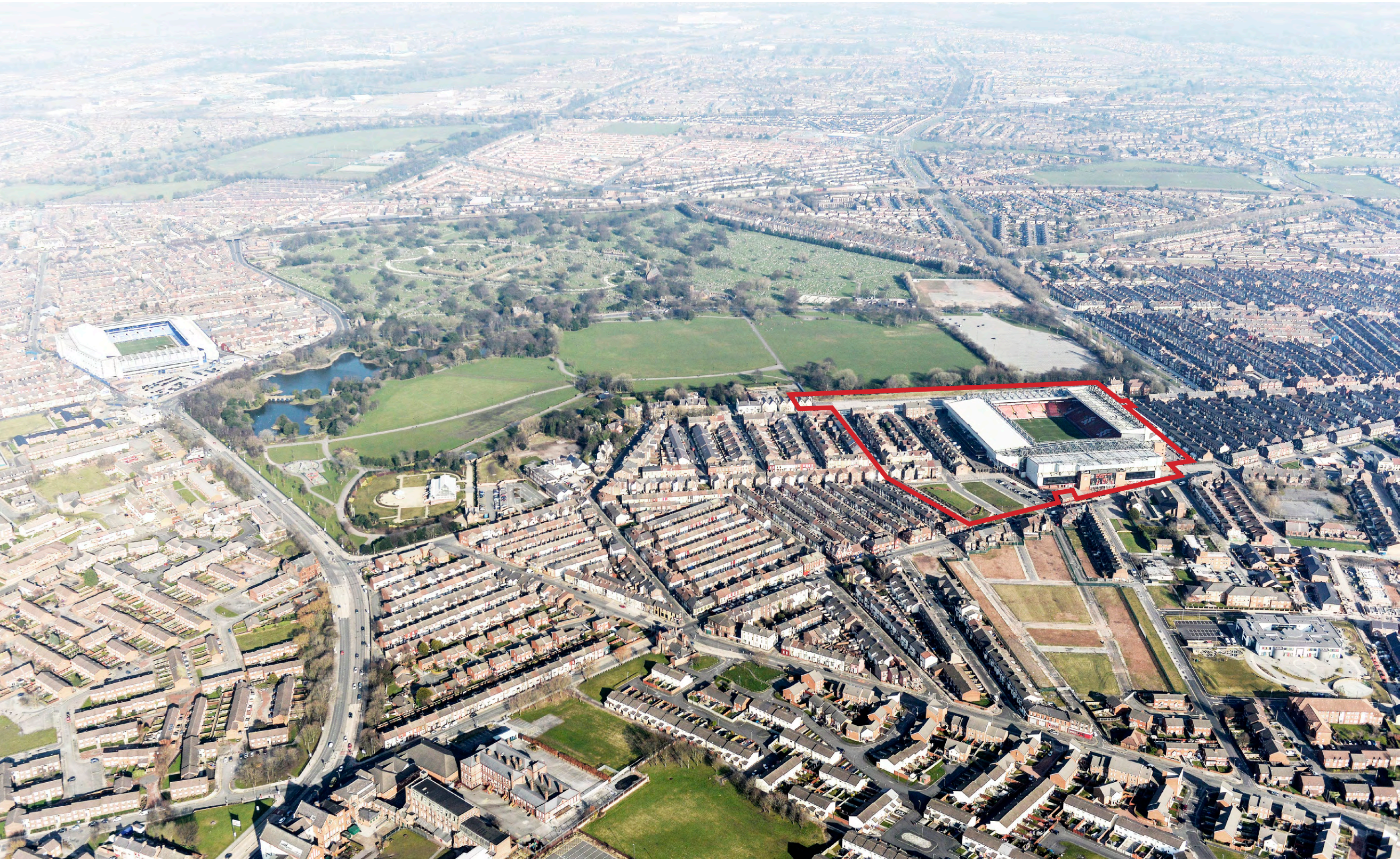
Aerial Base post-regeneration of Stanley Park