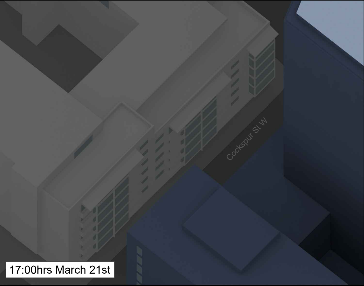
17:00hrs March 21st