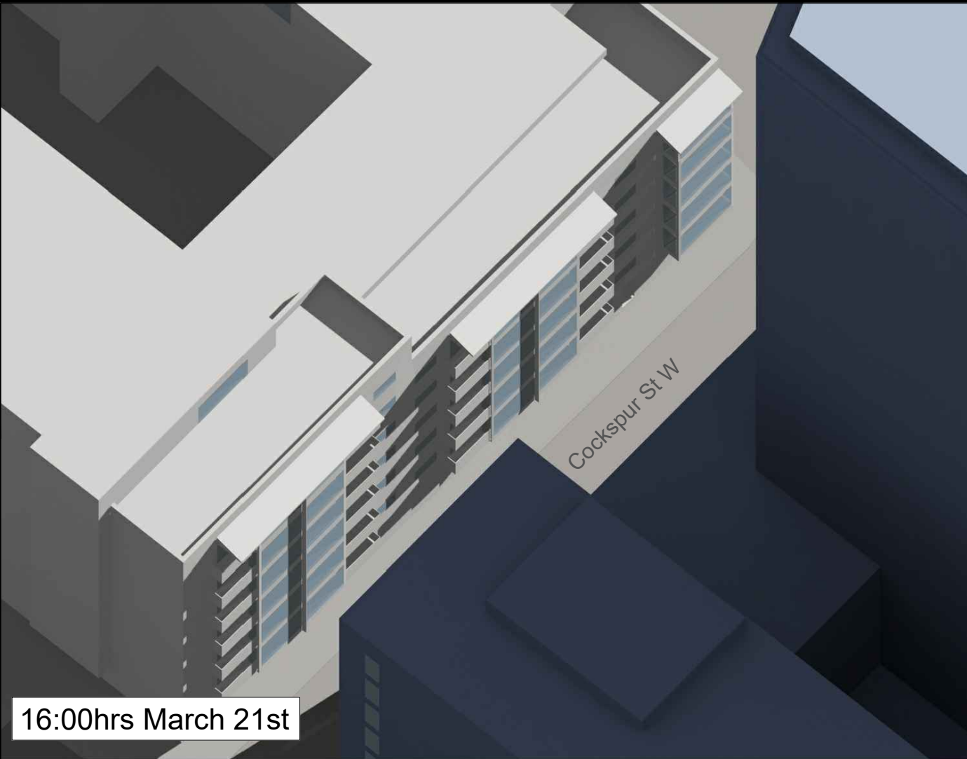
16:00hrs March 21st