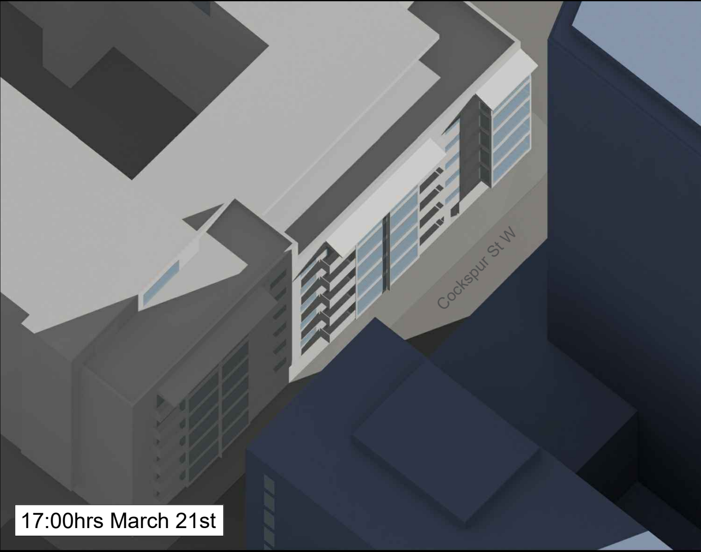
17:00hrs March 21st

NO DIMENSIONS TO BE SCALED FROM THIS DRAWING