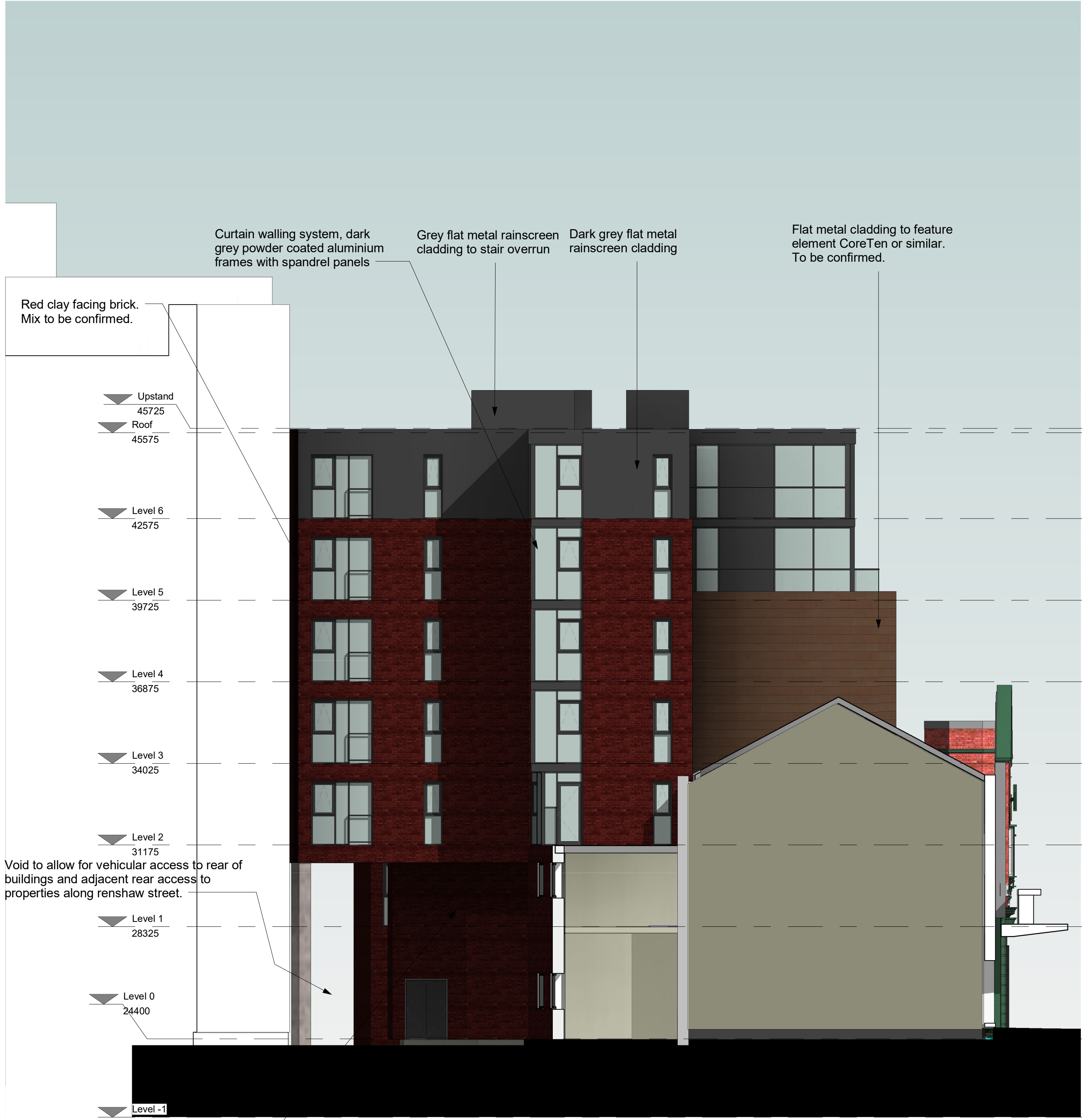
03_South Elevation 1 : 100