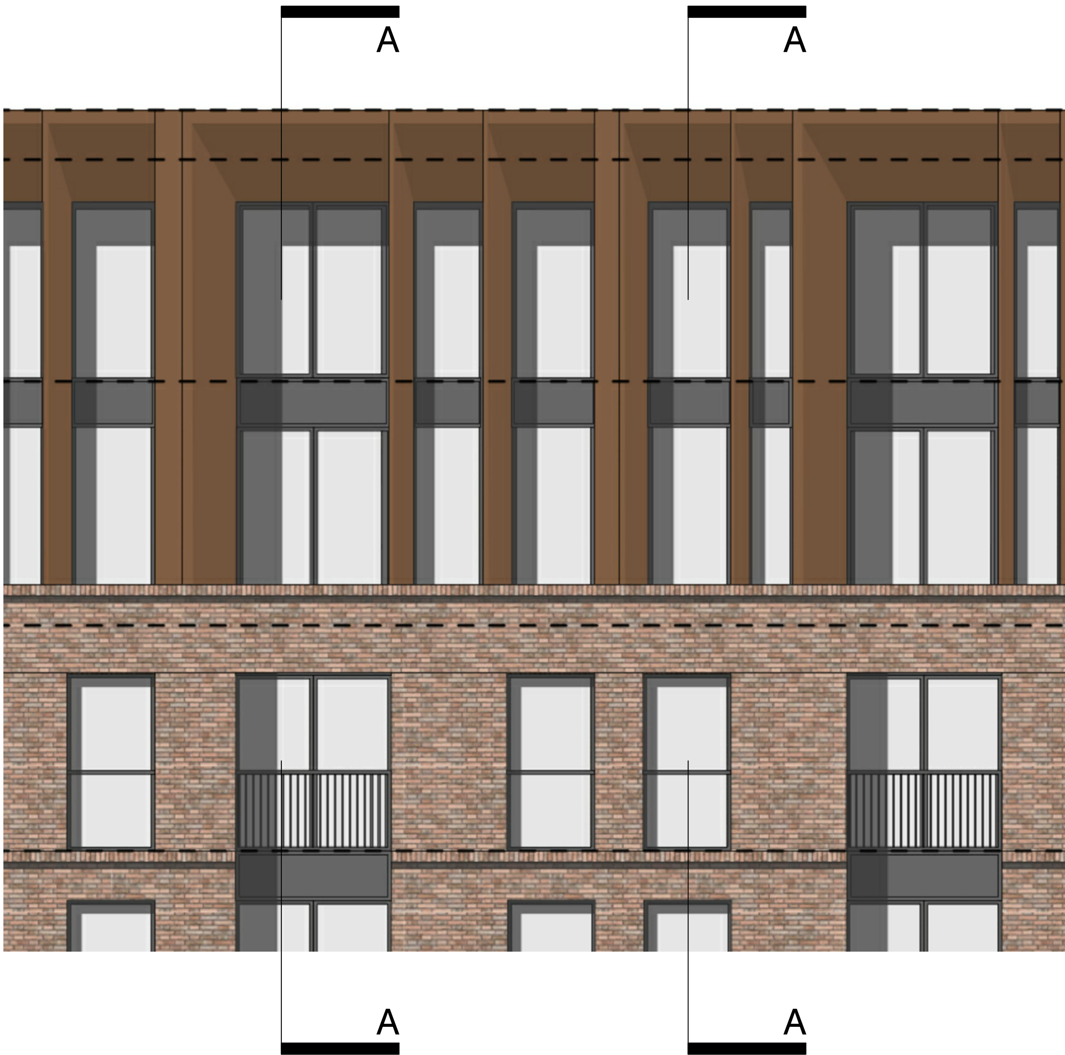
elevation typical brick facade elevation scale 1:50