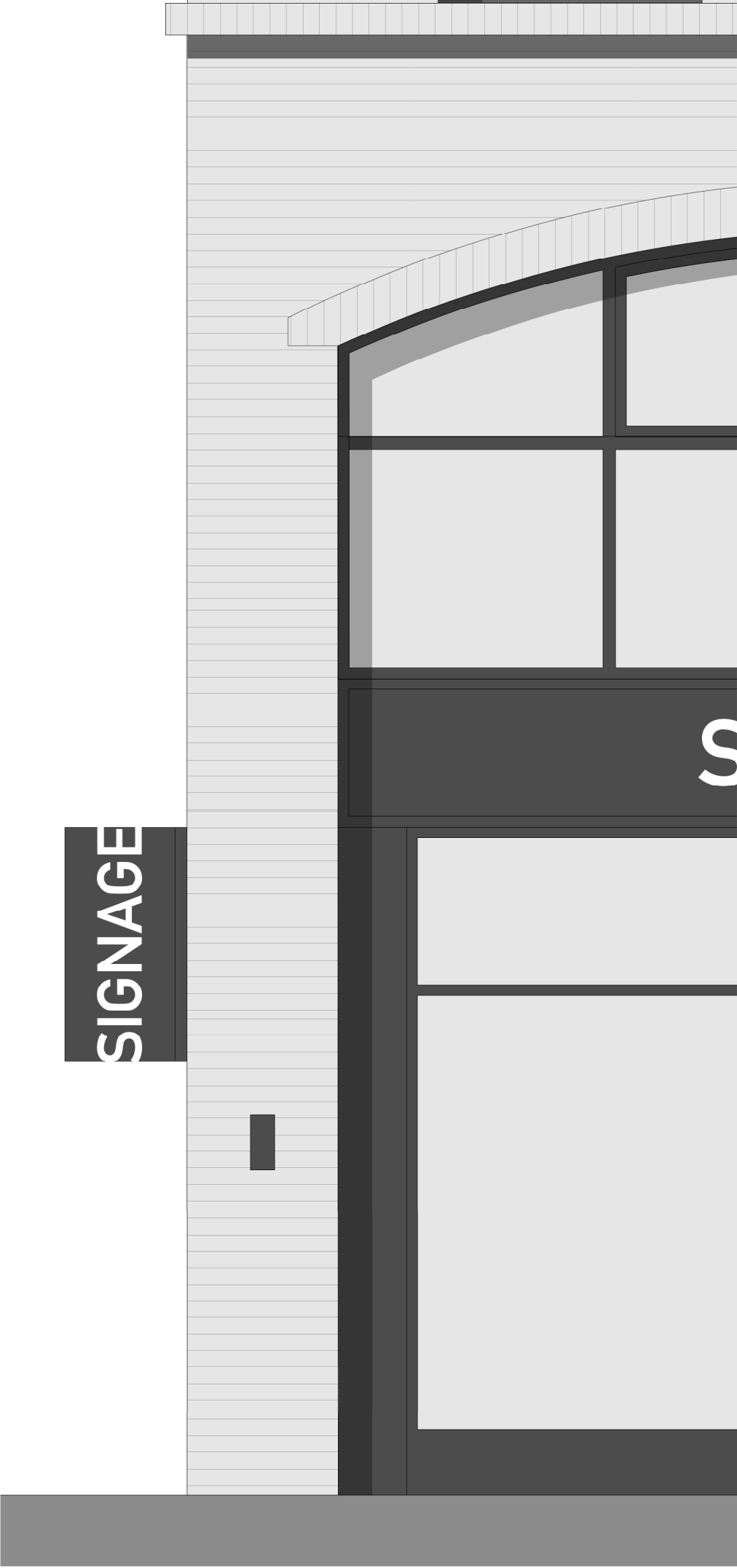
COMMERCIAL ENTRANCE - SIDE ELEVATION 1:25 @ A1