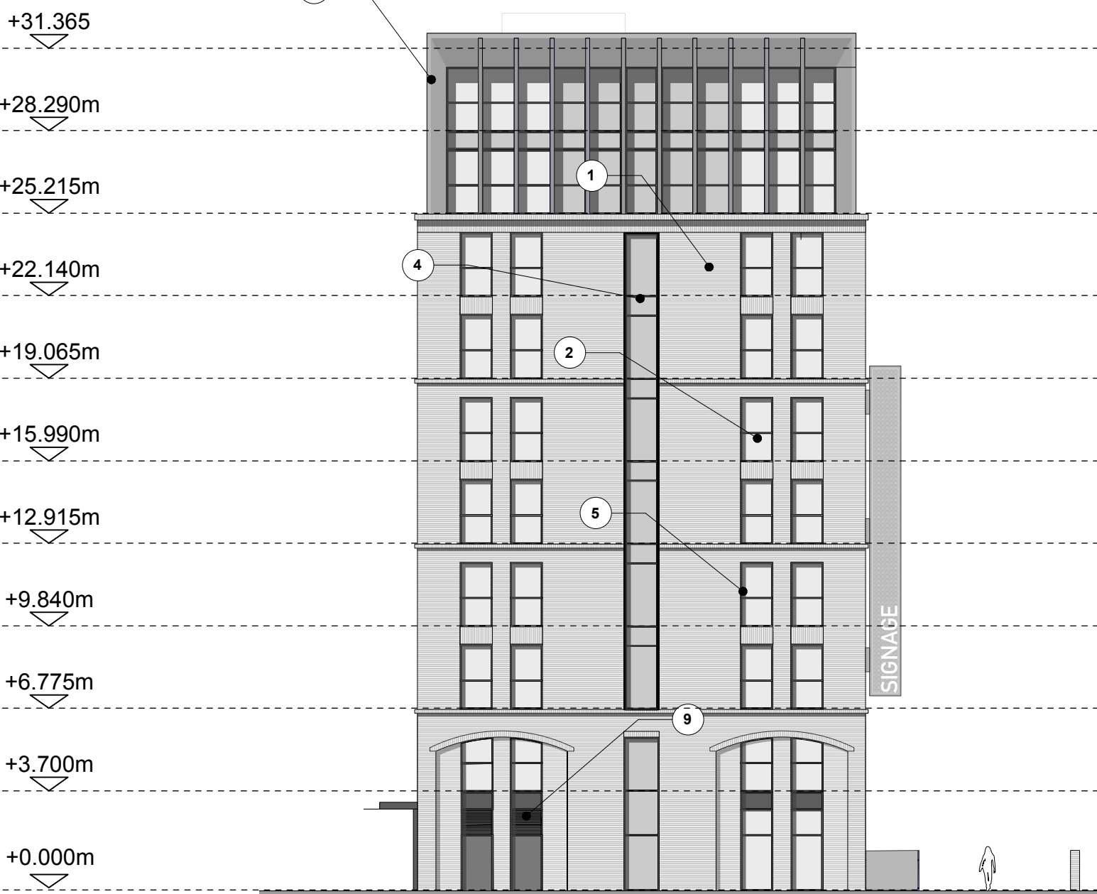
BLOCK D - NORTH ELEVATION 1:200 @ A1