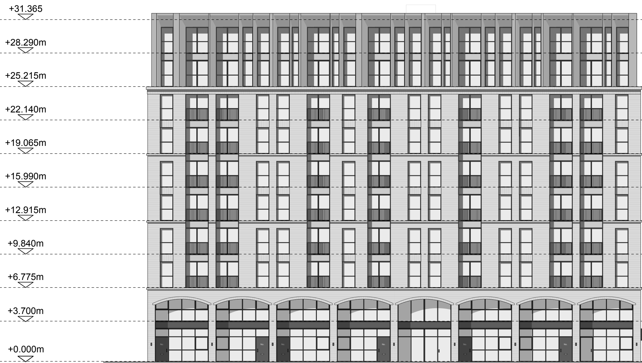
BLOCK D - WEST ELEVATION 1:200 @ A1