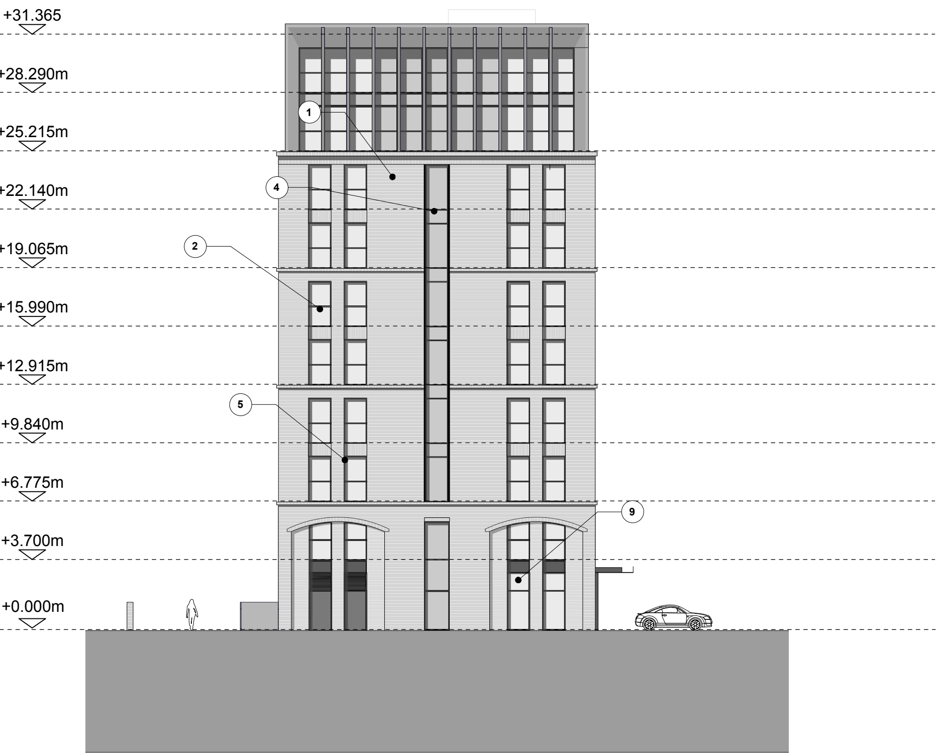
BLOCK C - SOUTH ELEVATION 1:200 @ A1