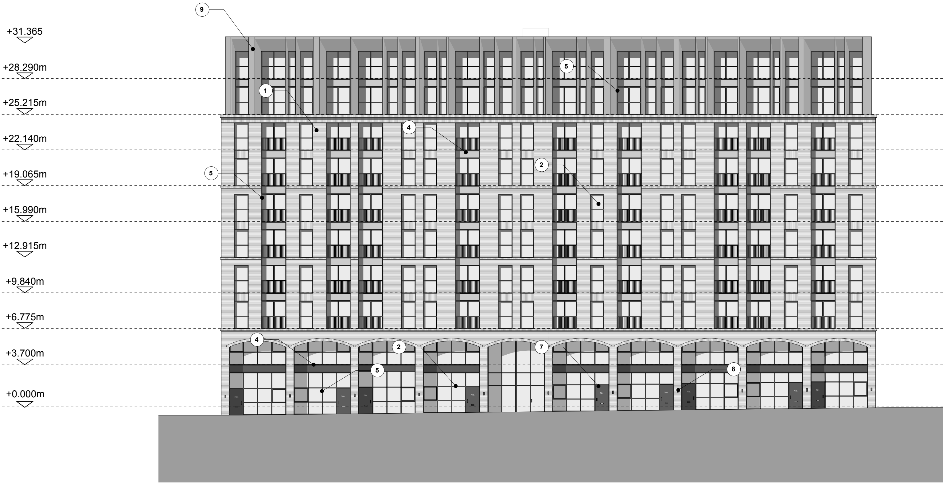
BLOCK C - WEST ELEVATION 1:200 @ A1