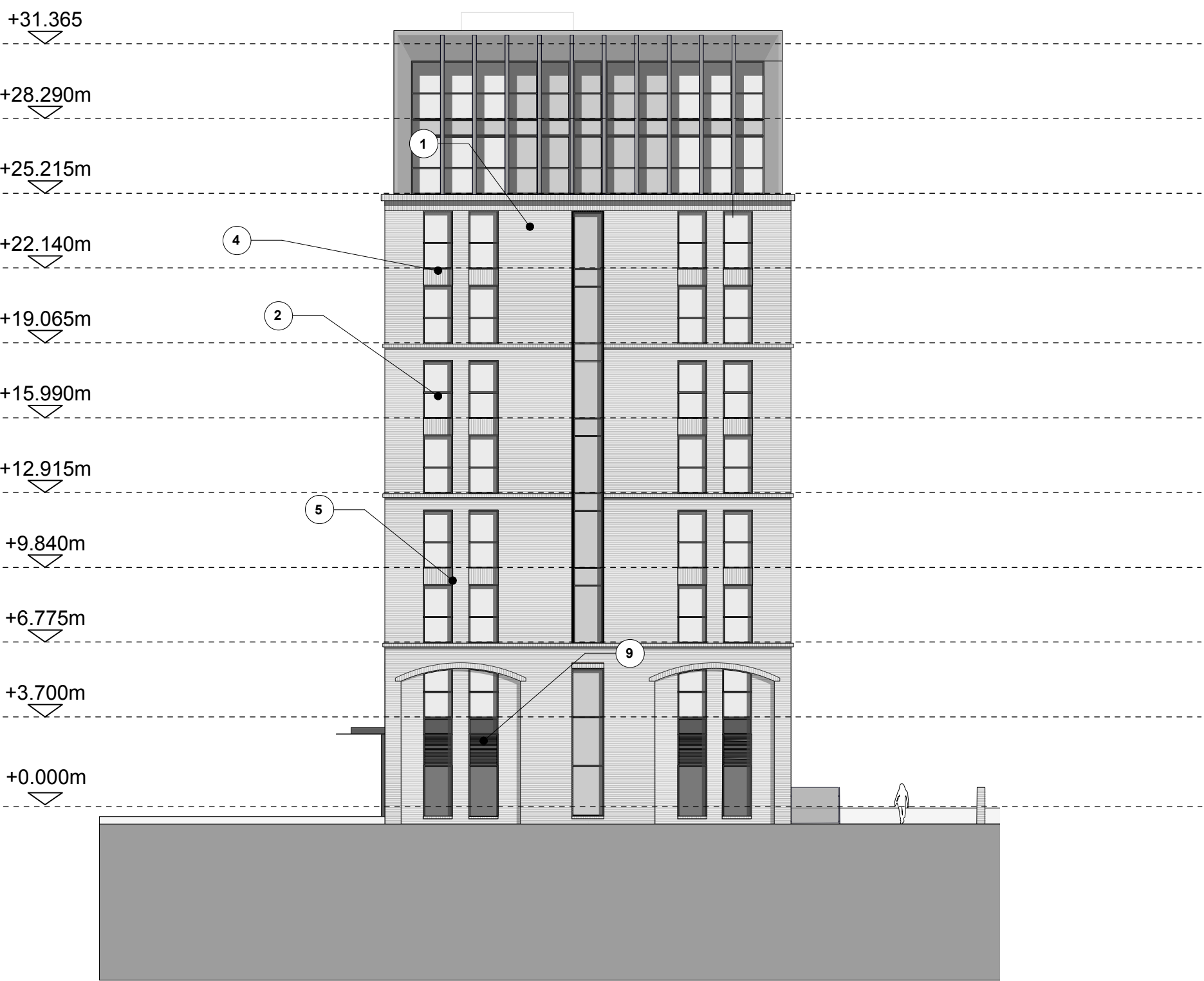
BLOCK C - NORTH ELEVATION 1:200 @ A1