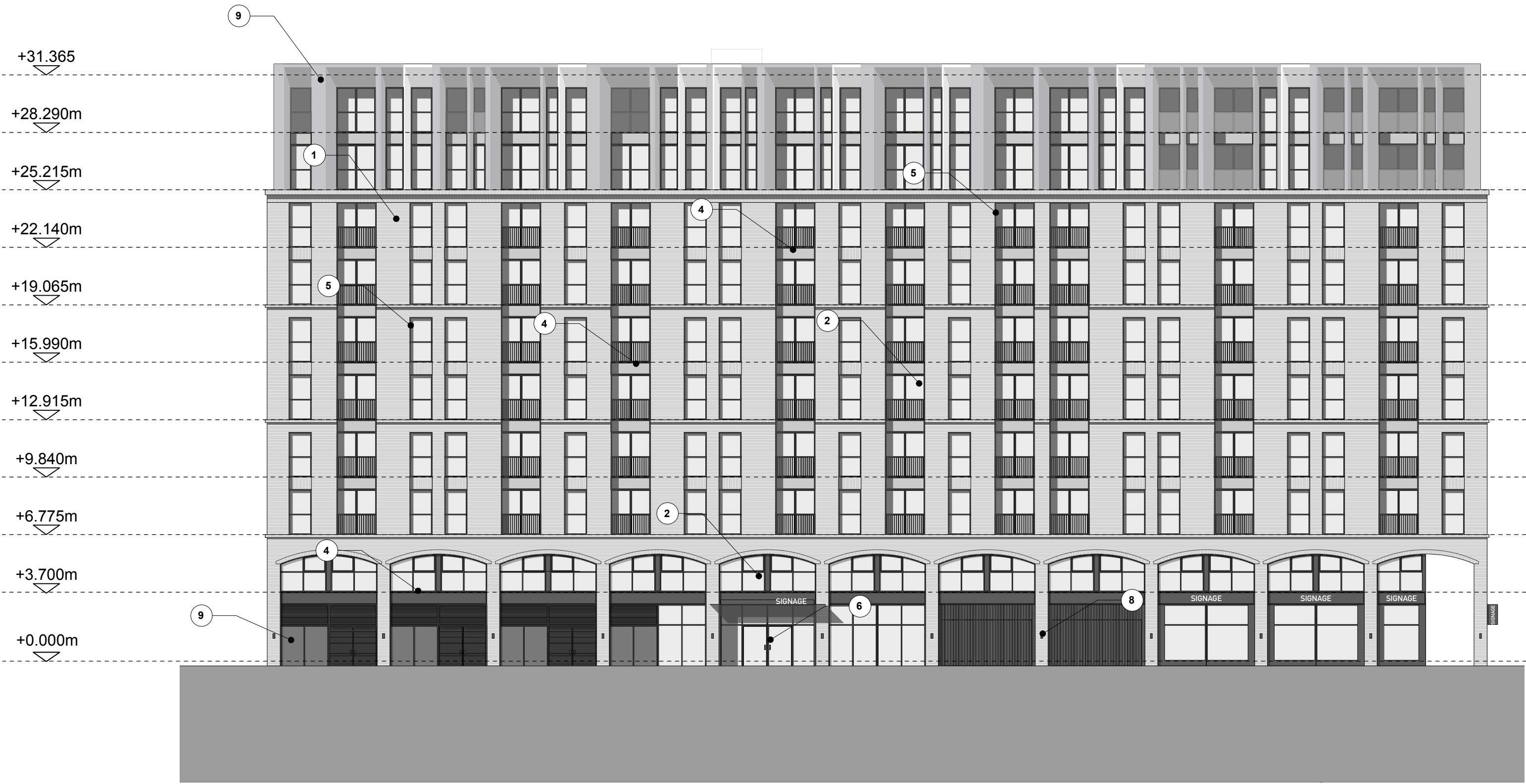
BLOCK B - WEST ELEVATION 1:200 @ A1