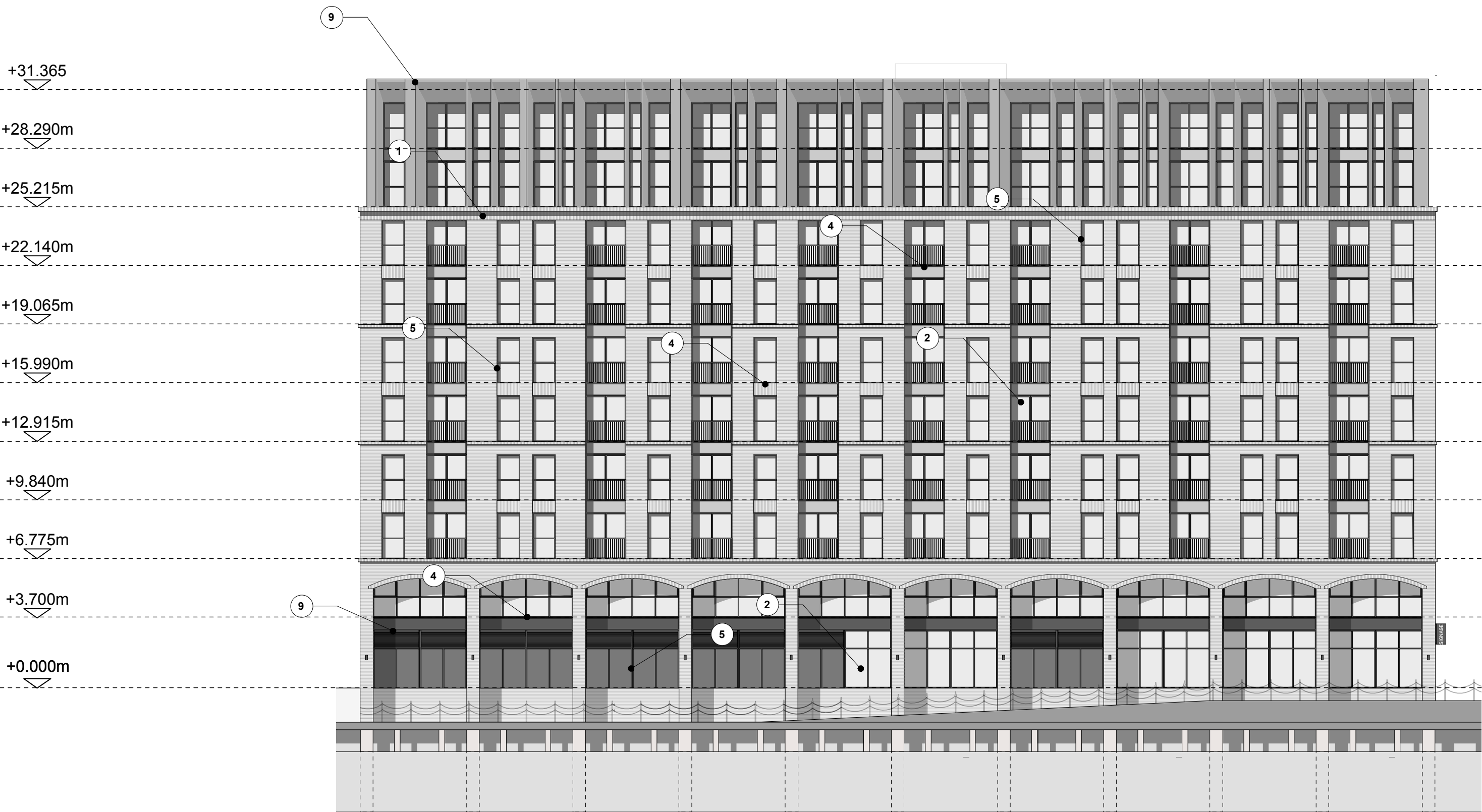
BLOCK A - EAST ELEVATION 1:200 @ A1