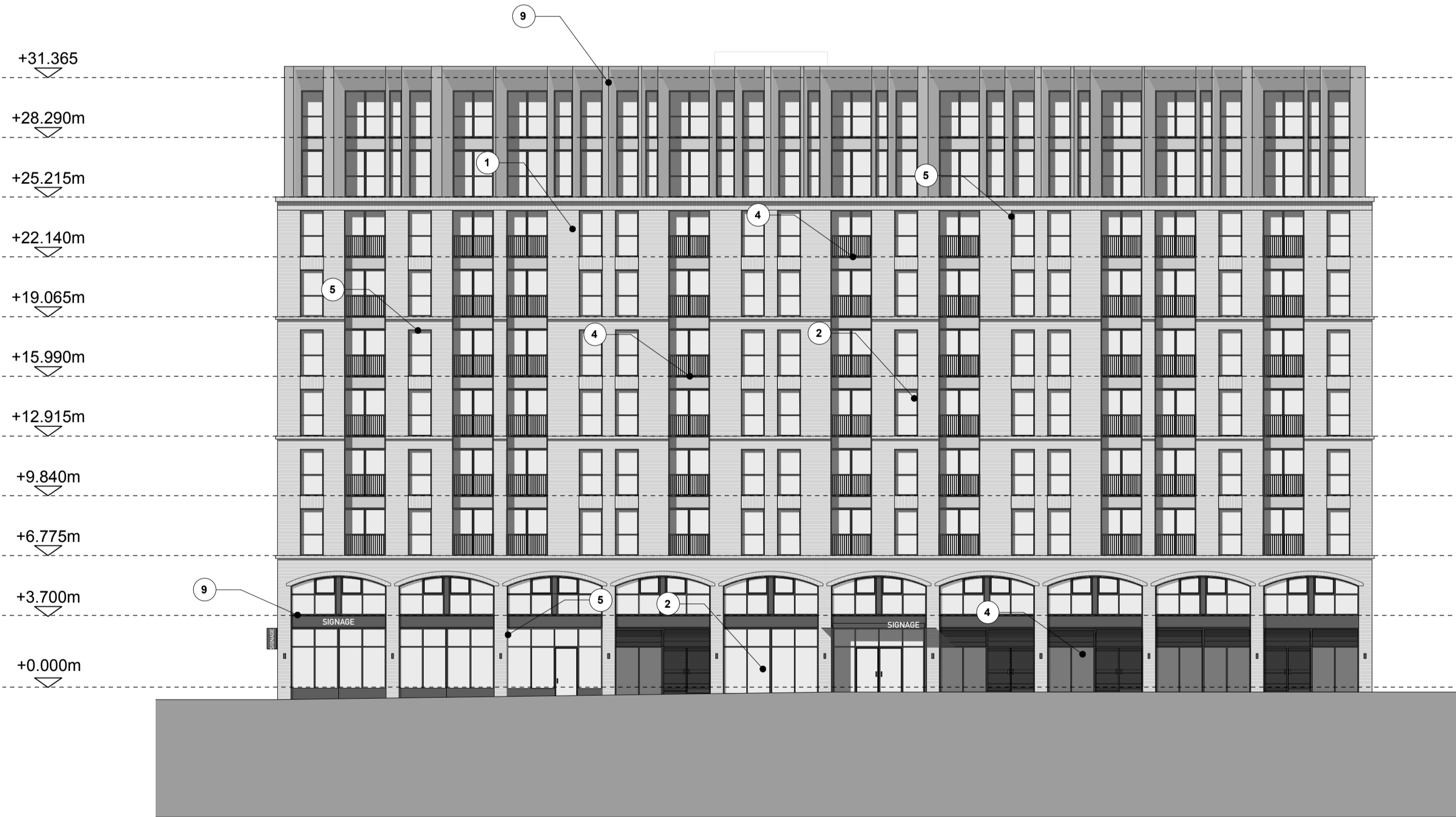
BLOCK A - WEST ELEVATION 1:200 @ A1