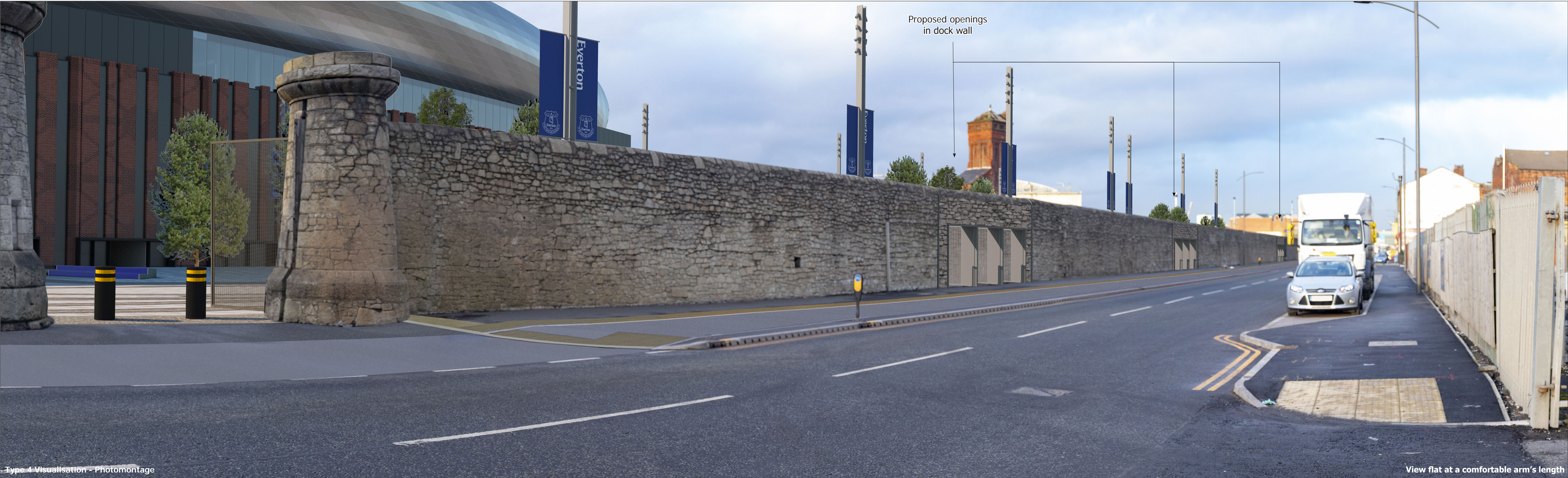
Type 4 Visualisation - Photomontage