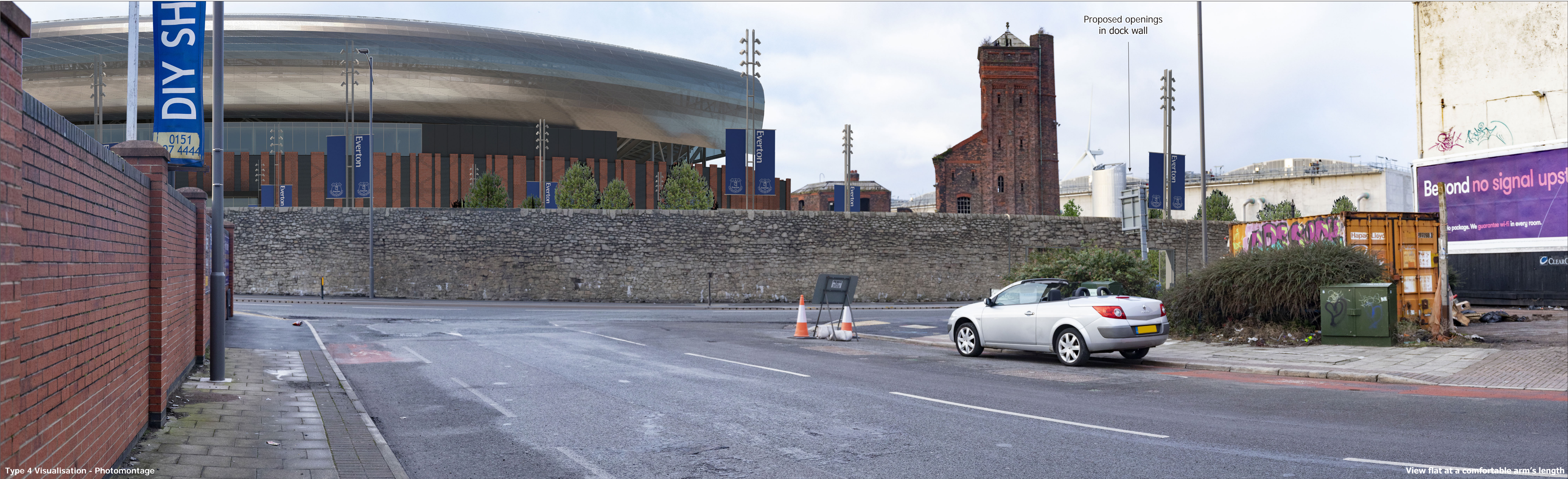
Type 4 Visualisation - Photomontage