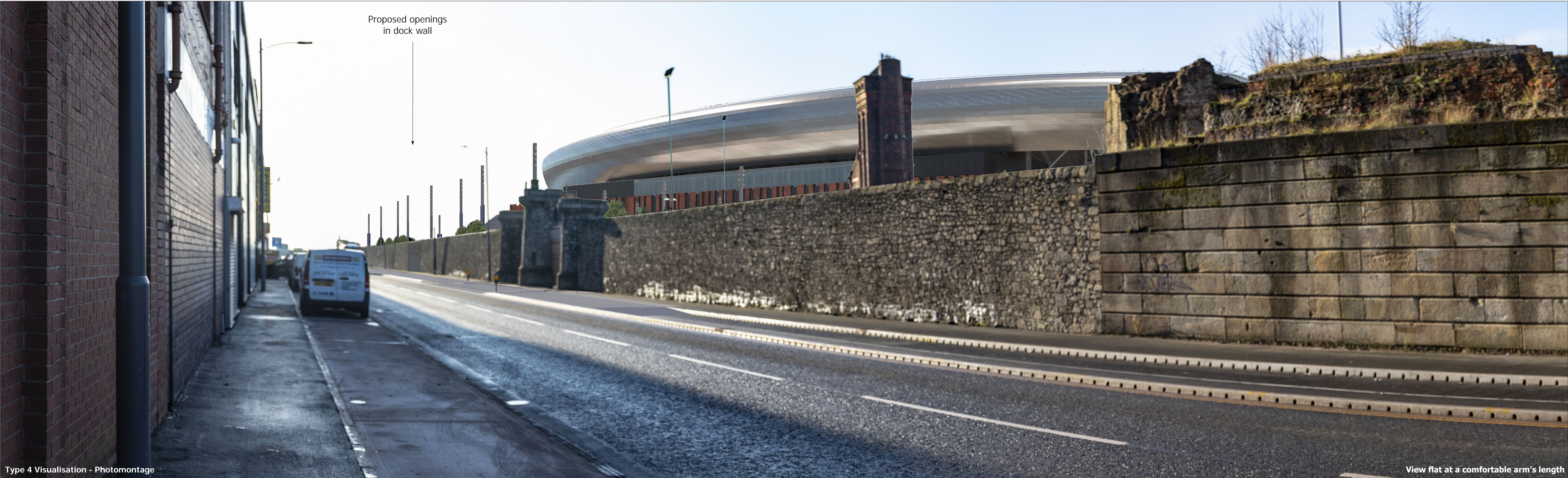
Type 4 Visualisation - Photomontage