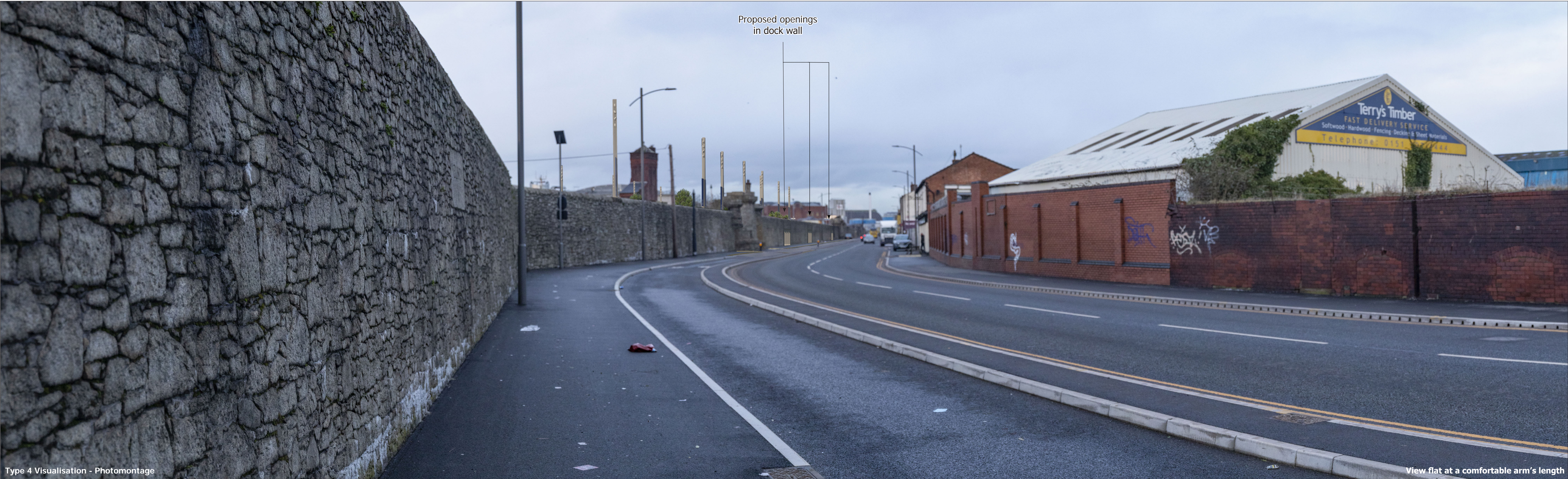
Type 4 Visualisation - Photomontage