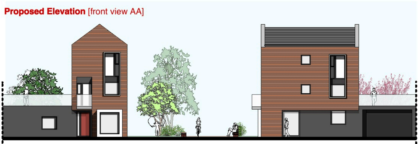
Proposed Elevation [front view AA]