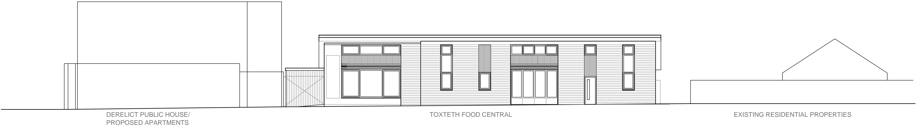
LONG ELEVATION: WINDSOR STREET