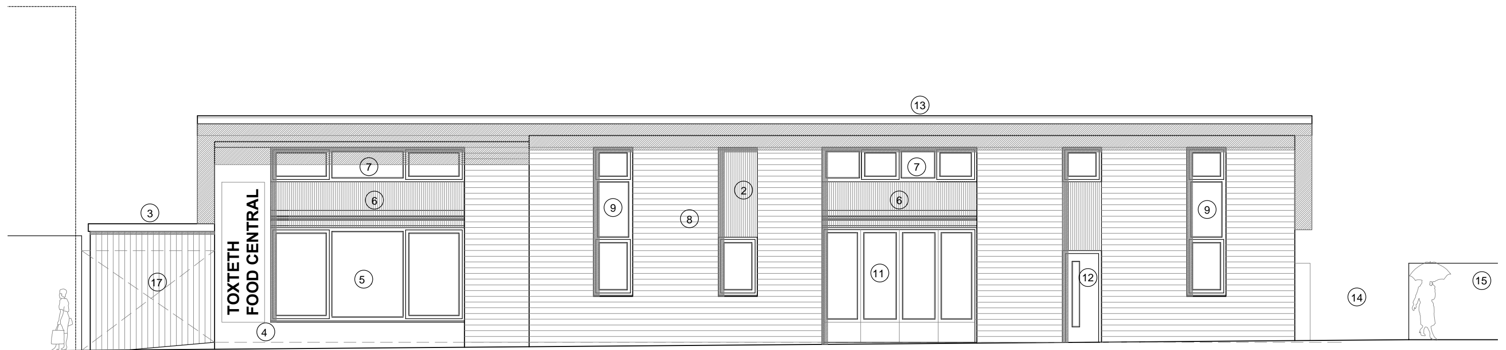
NORTH EAST ELEVATION: WINDSOR STREET