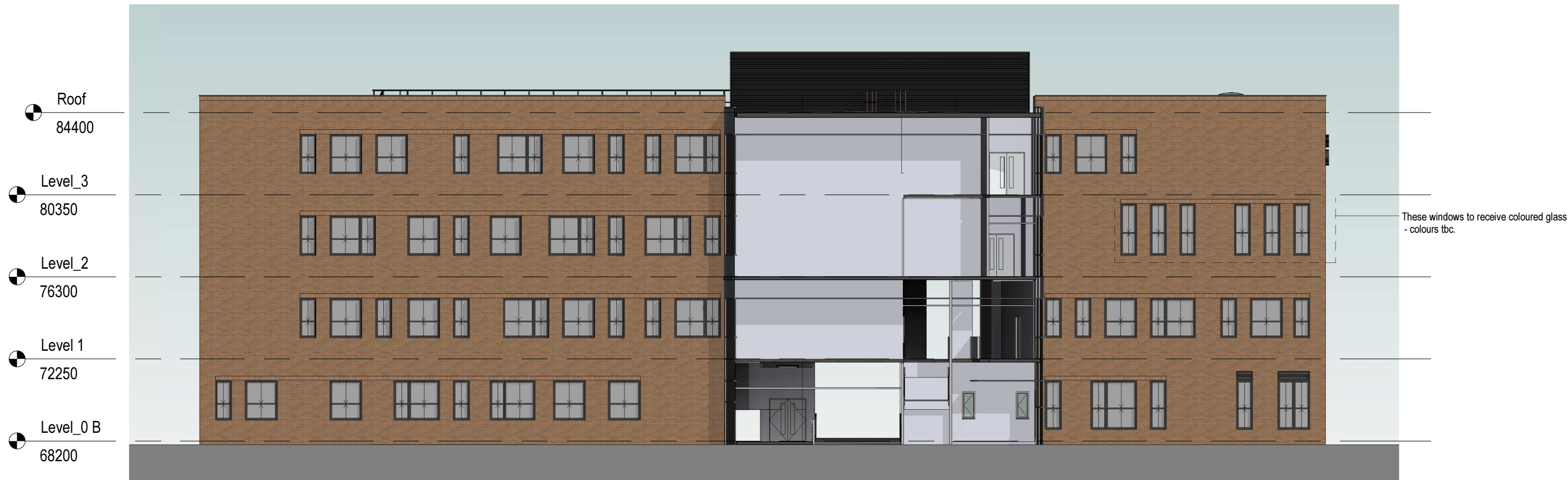
3 Block B East Elevation