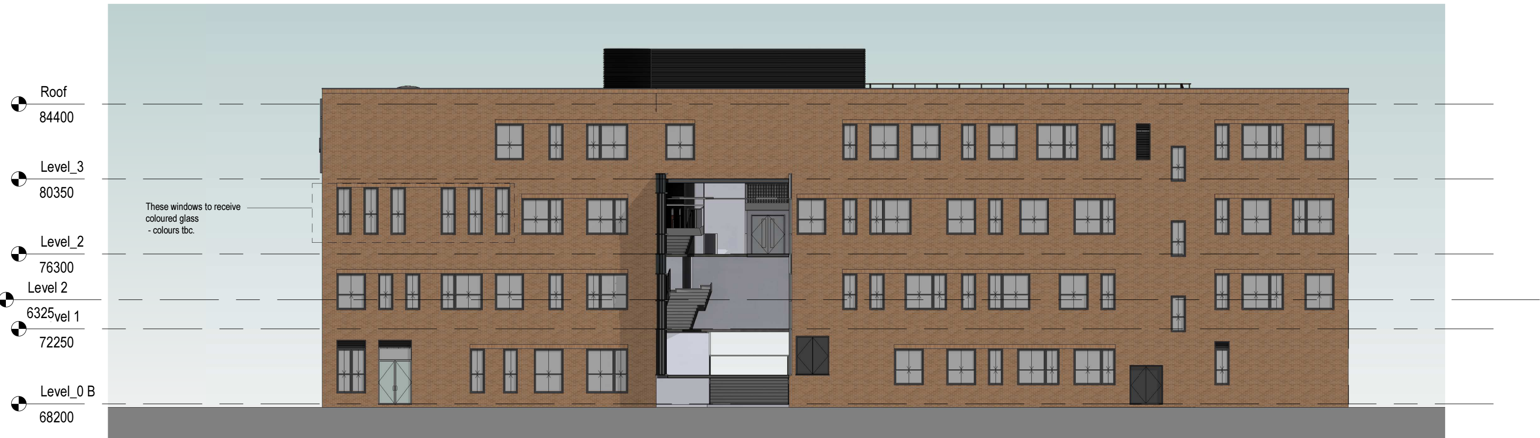
4 Block B West Elevation