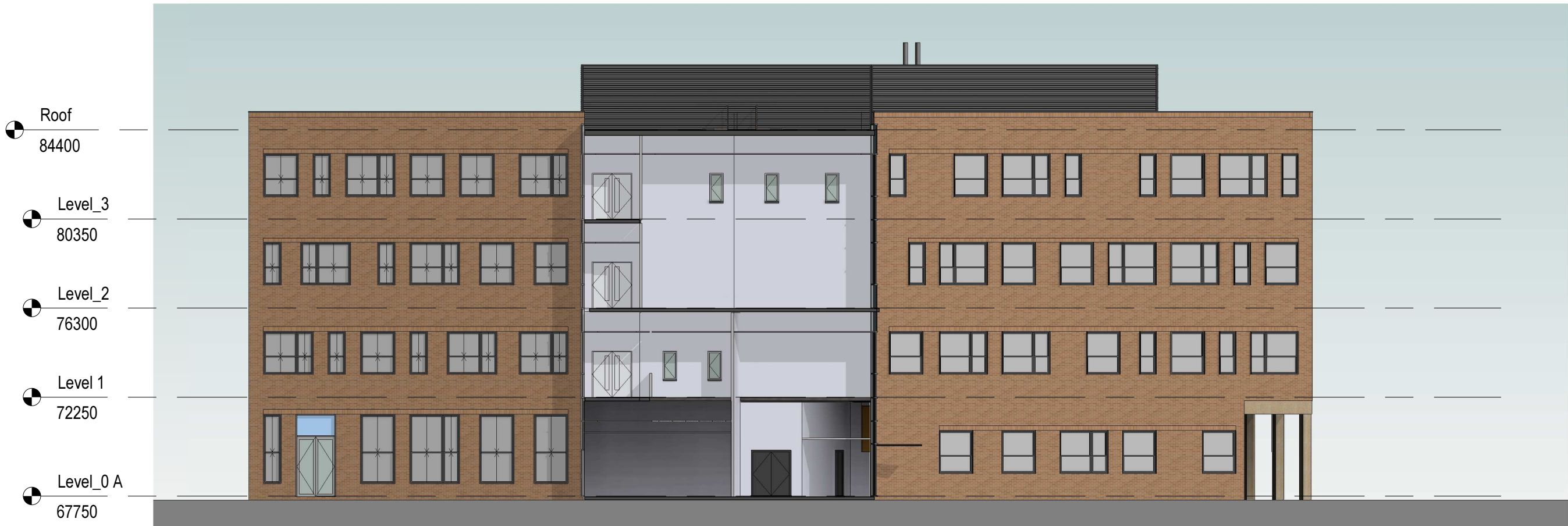
2 Block A West Elevation