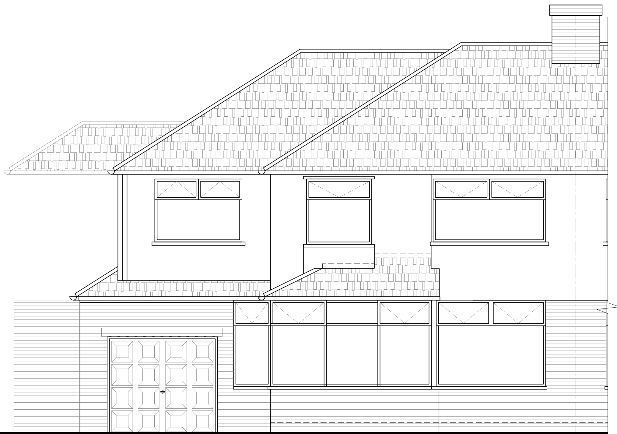
EXSITING FRONT ELEVATION