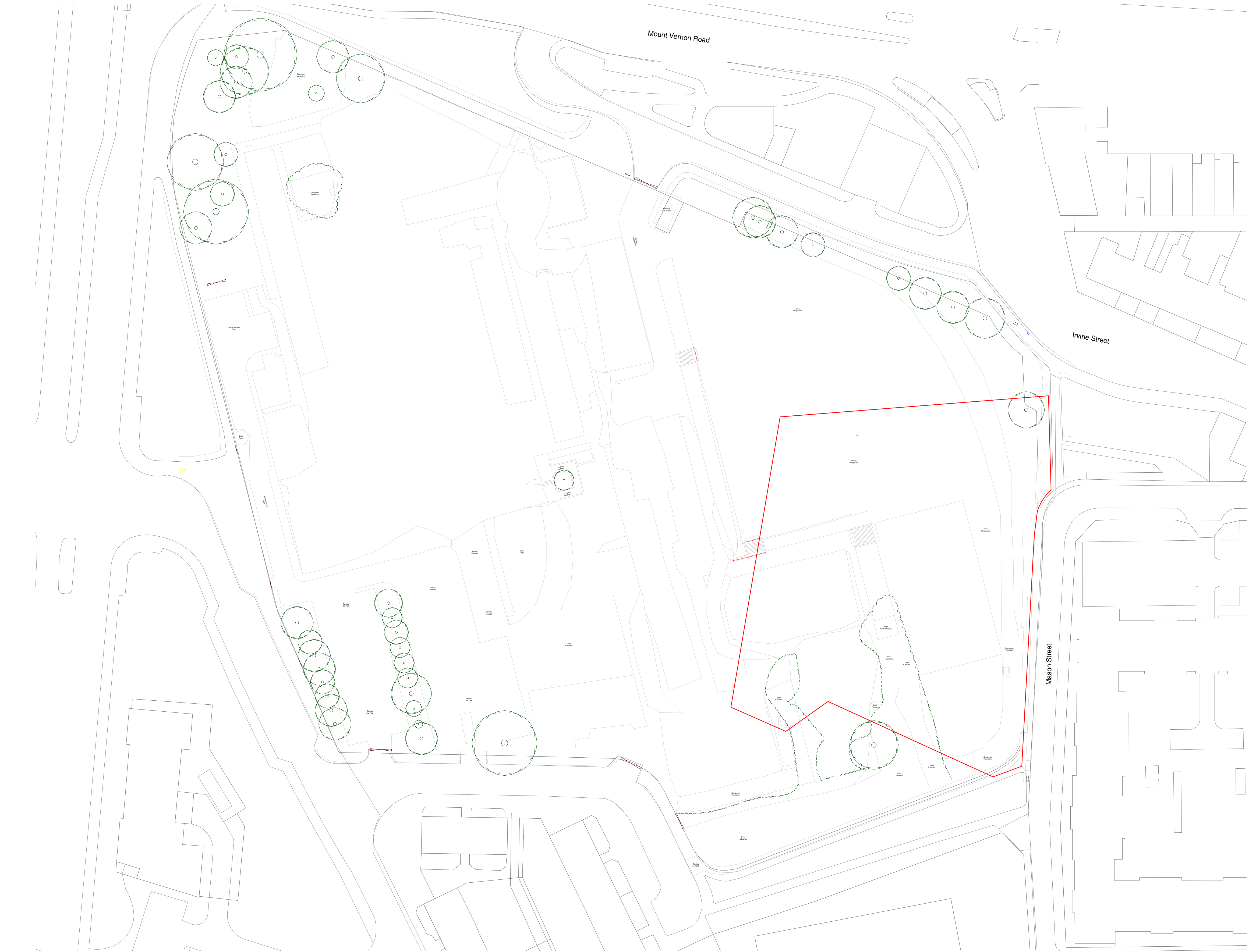
1 Existing Site Plan