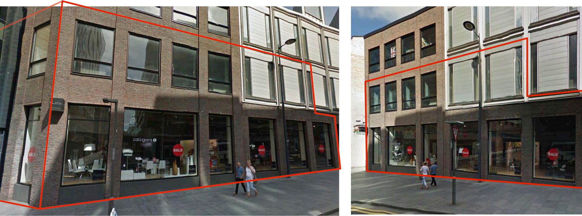
EXTERIOR VIEWS OF EXISTING SITE