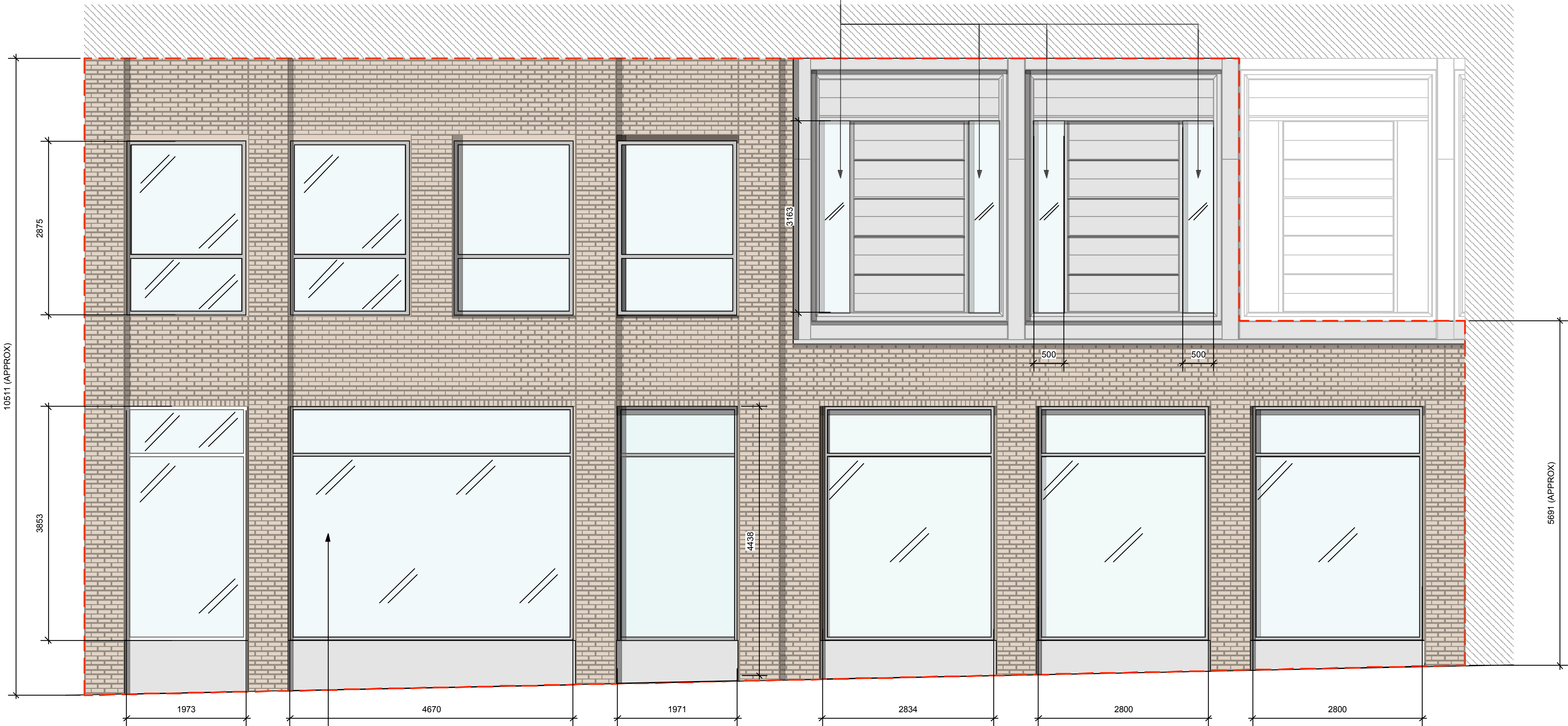
1 EL01 EXISTING EXTERIOR ELEVATION 01 Scale: 1:40