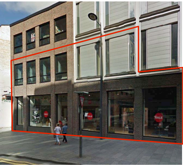
EXTERIOR VIEWS OF EXISTING SITE