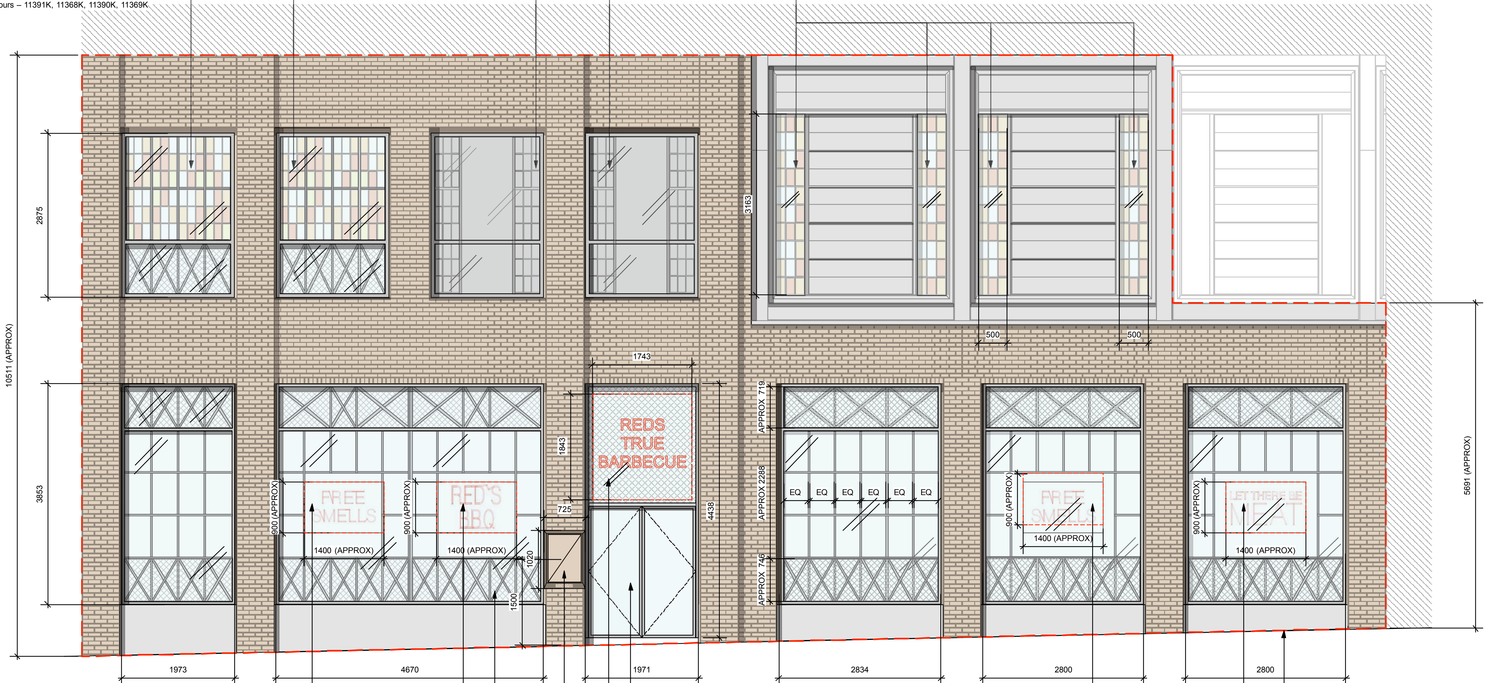
1 PROPOSED EXTERIOR ELEVATION 01 EL01 Scale: 1:40

FEATURE LIGHTING: "REDS" FEATURE NEON SIGNS (DIMS & DESIGN TBC) HUNG ON STEEL CHAIN TO THE INTERIOR OF GLAZING - BY RSS