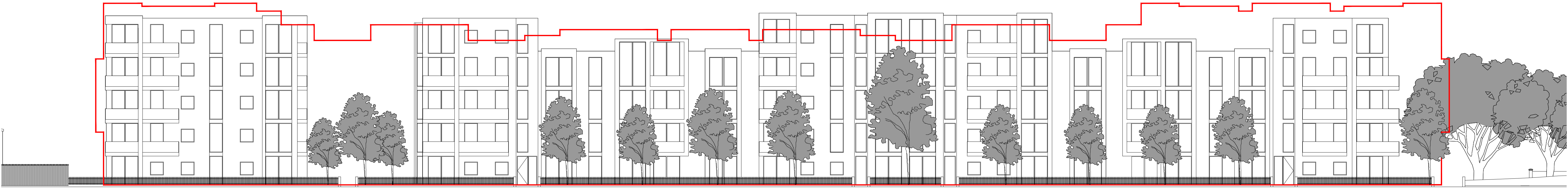
ELEVATION A - UPPER PARLIAMENT STREET