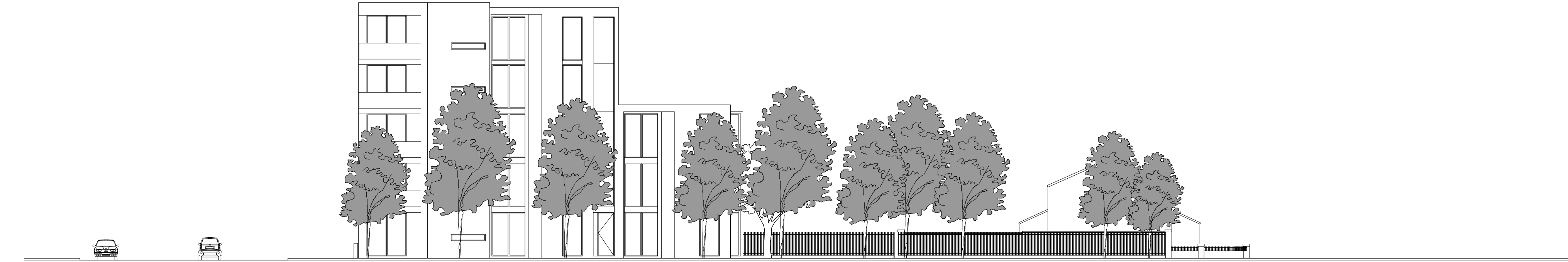
ELEVATION D - BLOCK TWO FROM PROPOSED PATH