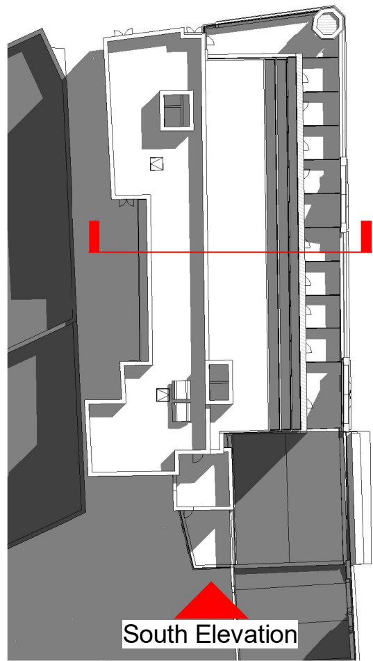
Key Plan 1 : 500

GENERAL NOTES: DAY Architectural Ltd accepts no responsibility for any costs, losses or claims whatsoever arising from these drawings, specifications and related documents unless there is full compliance with the Client or any unauthorised user of the following: 1 All boundaries, dimensions and levels are to be checked on site before construction and any discrepancies reported to the Architect / Designer. 2 Partial Service: Any discrepancies with site or other information is to be advised to the Architect / Designer and direction and / or approval is to be sought before the implementation of the detail. 3 Block and site plans are reproduced under license from the Ordnance Survey. 4 Do not scale this drawing. 5 For the purpose of coordination, all relevant parties must check this information prior to implementation and report any discrepancies to the Architect / Designer.