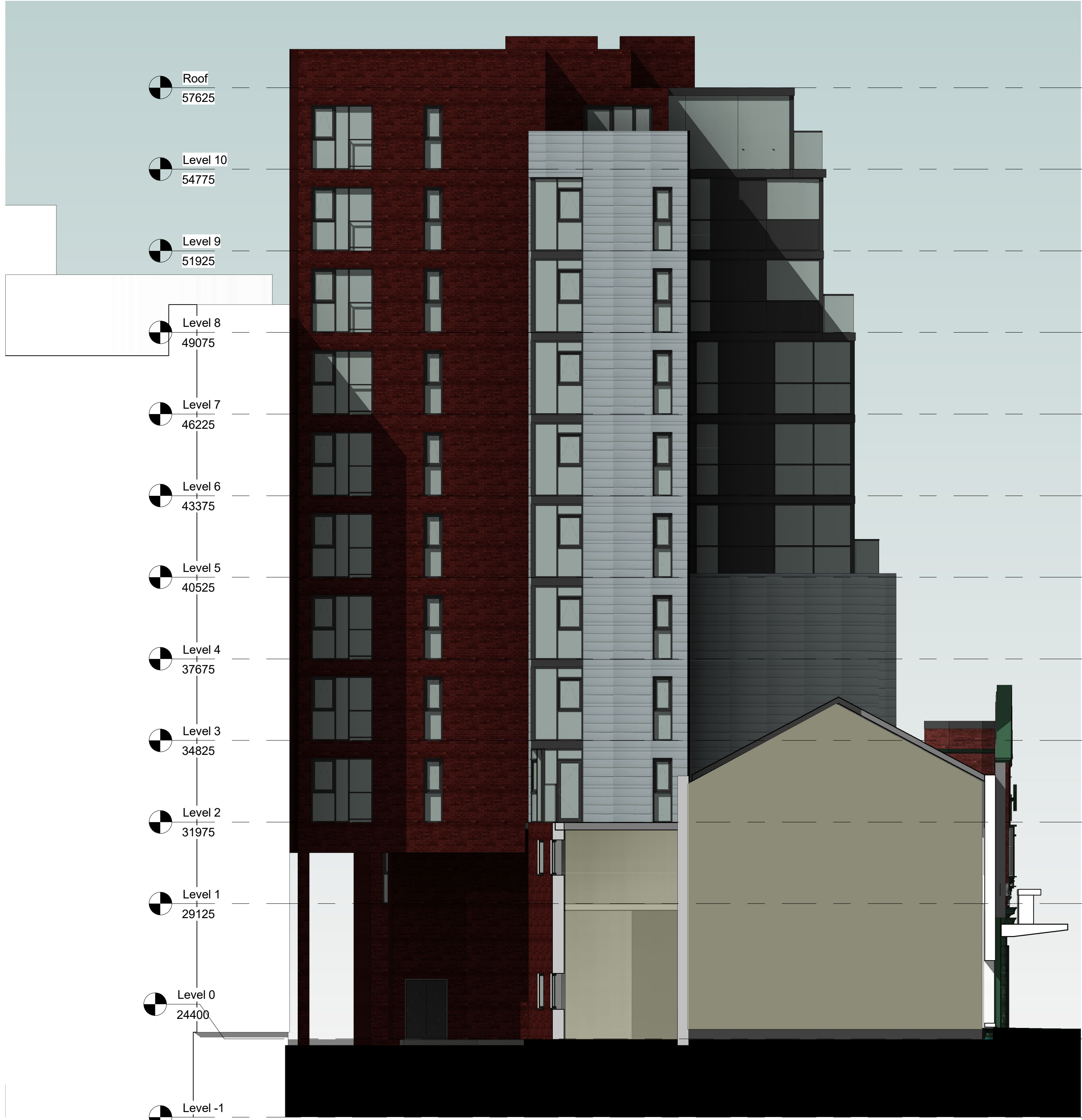
03_South Elevation 1 : 100