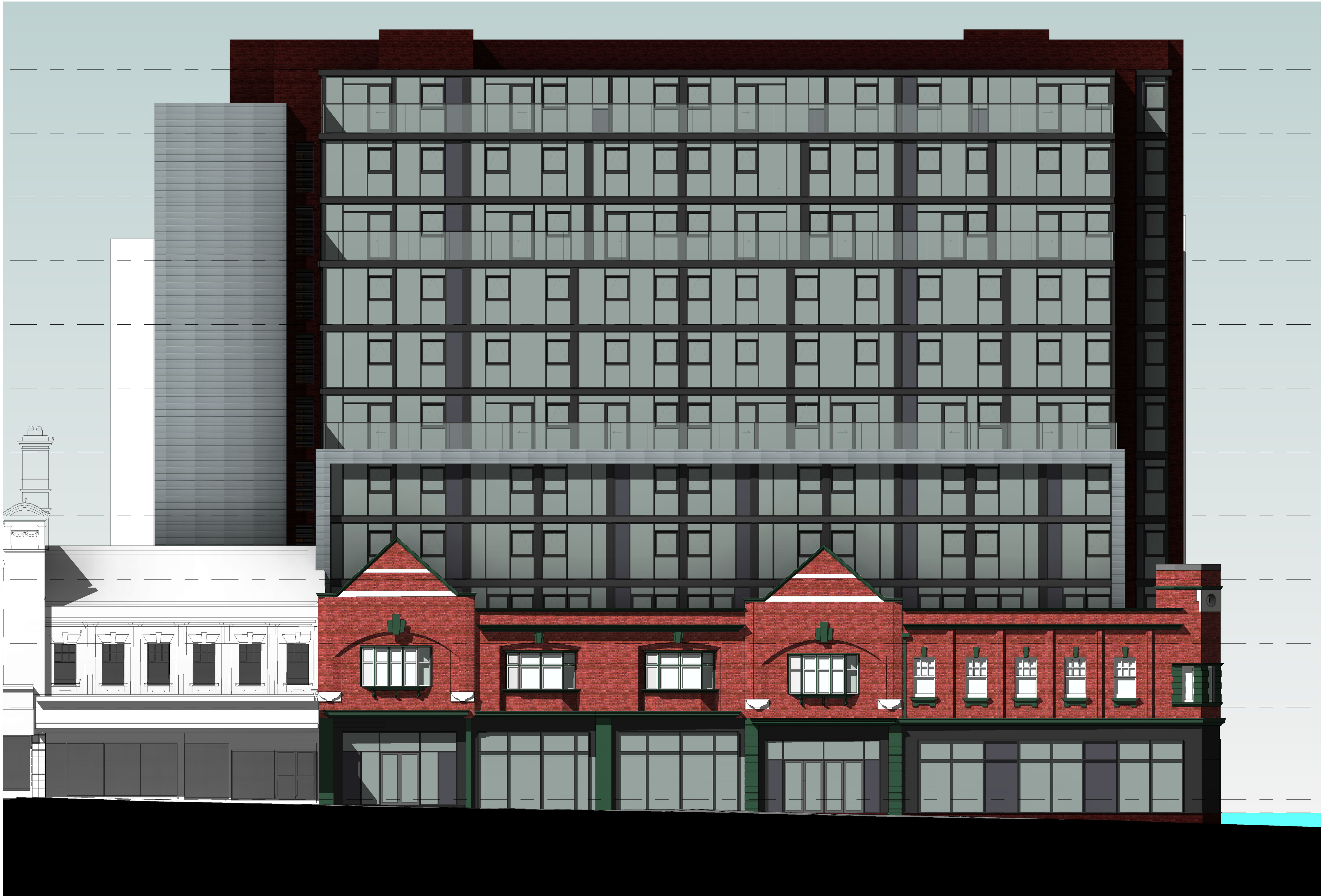
01_East Elevation 1 : 100