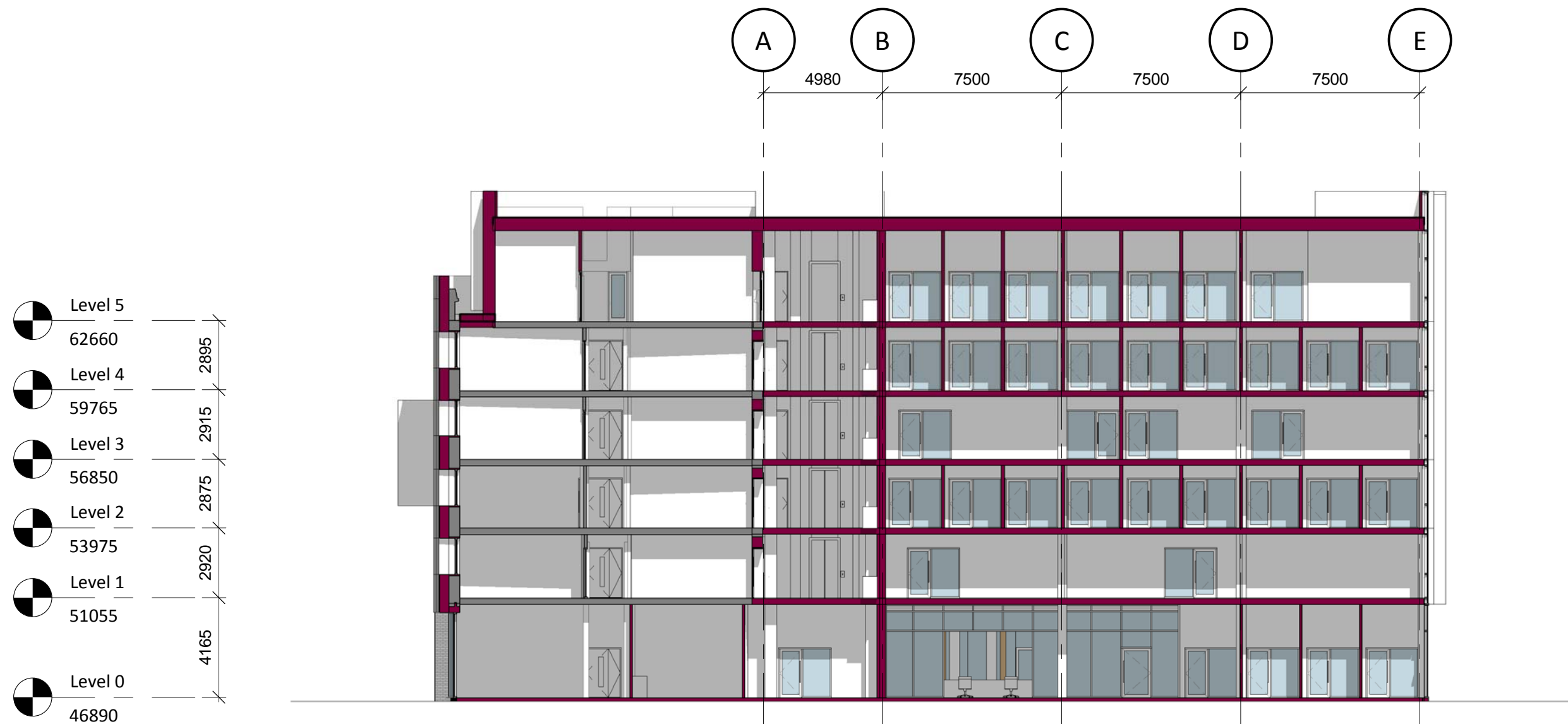
Proposed Section C-C