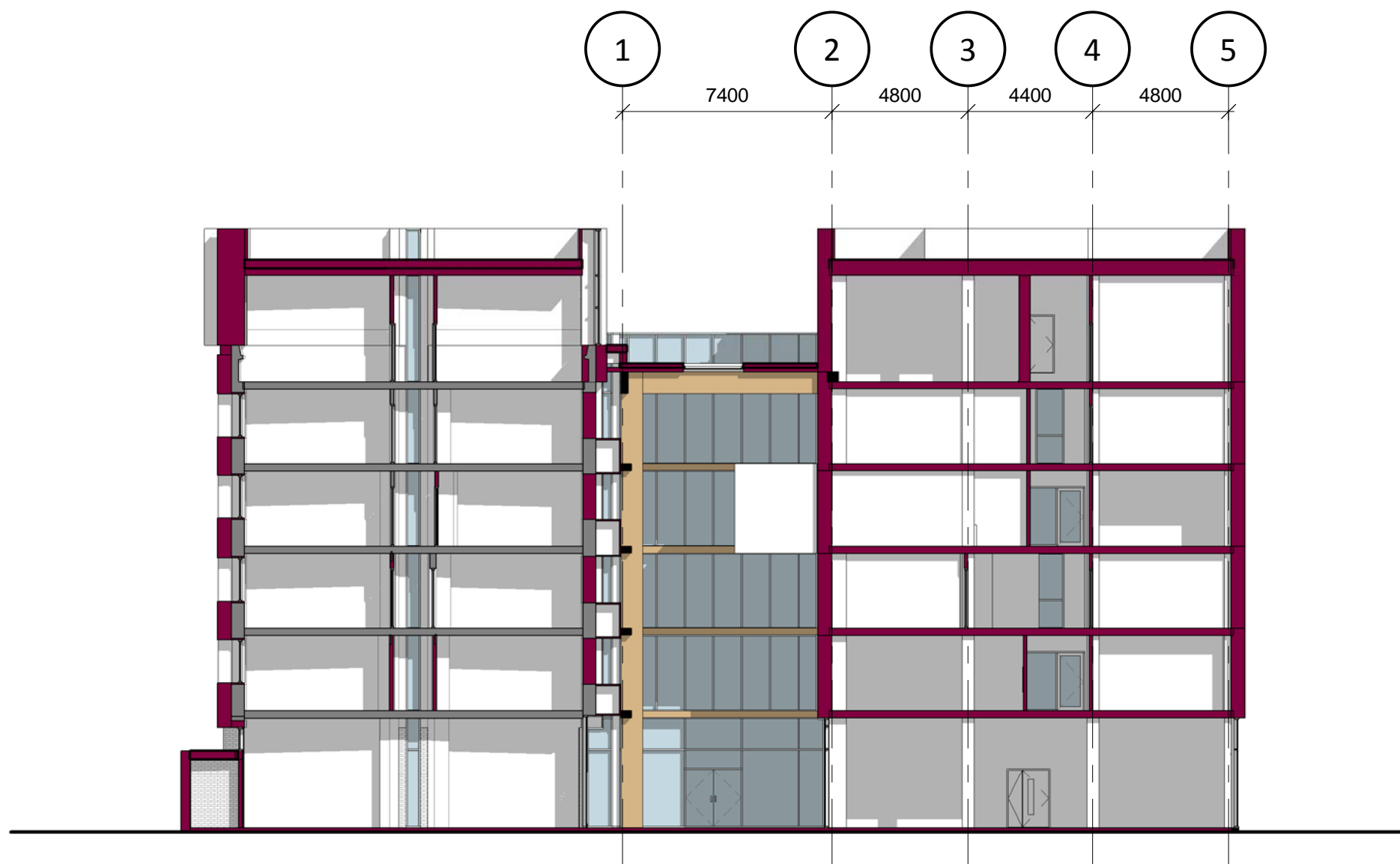
Proposed Section B-B