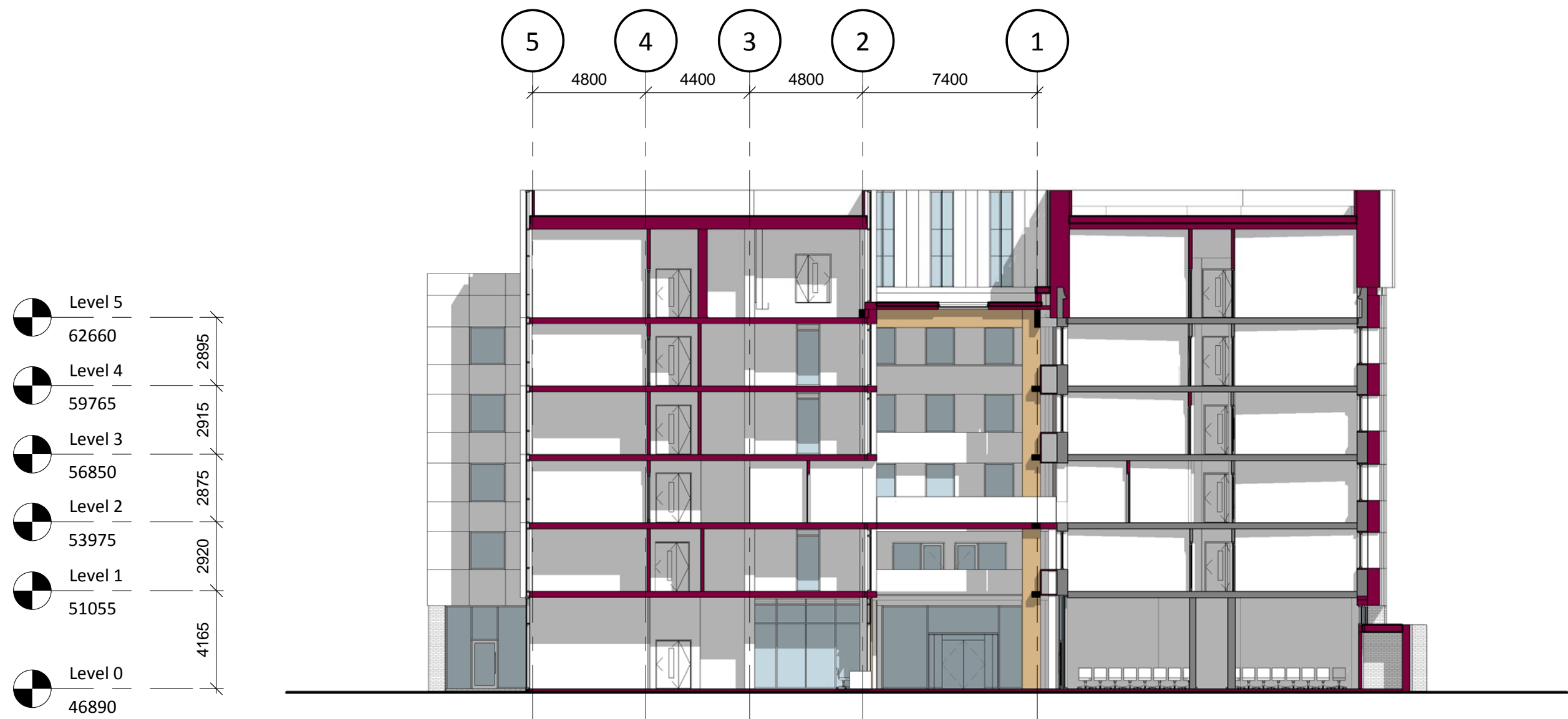
Proposed Section A-A