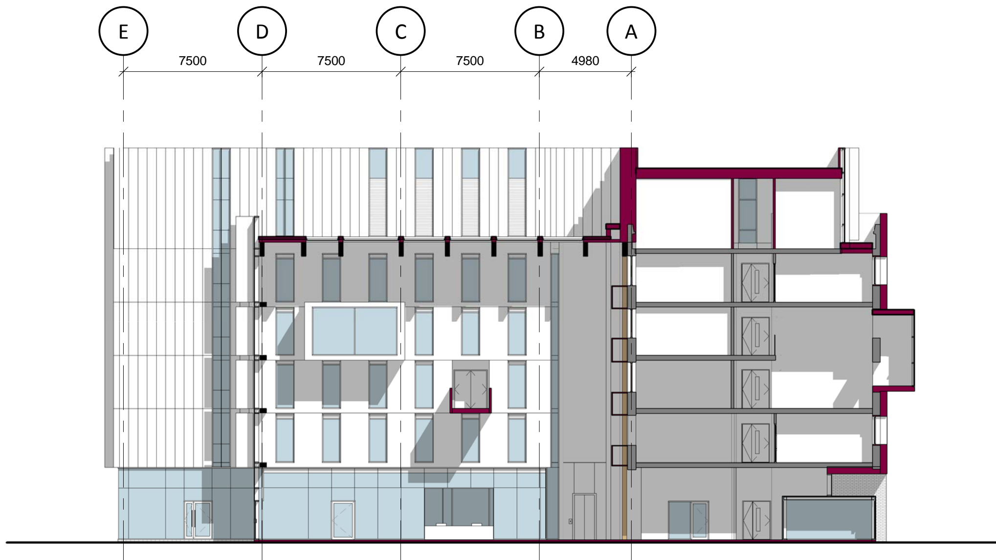
Proposed Section D-D