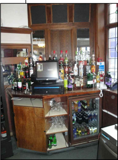
BACKFITTING TO BE AMENDED