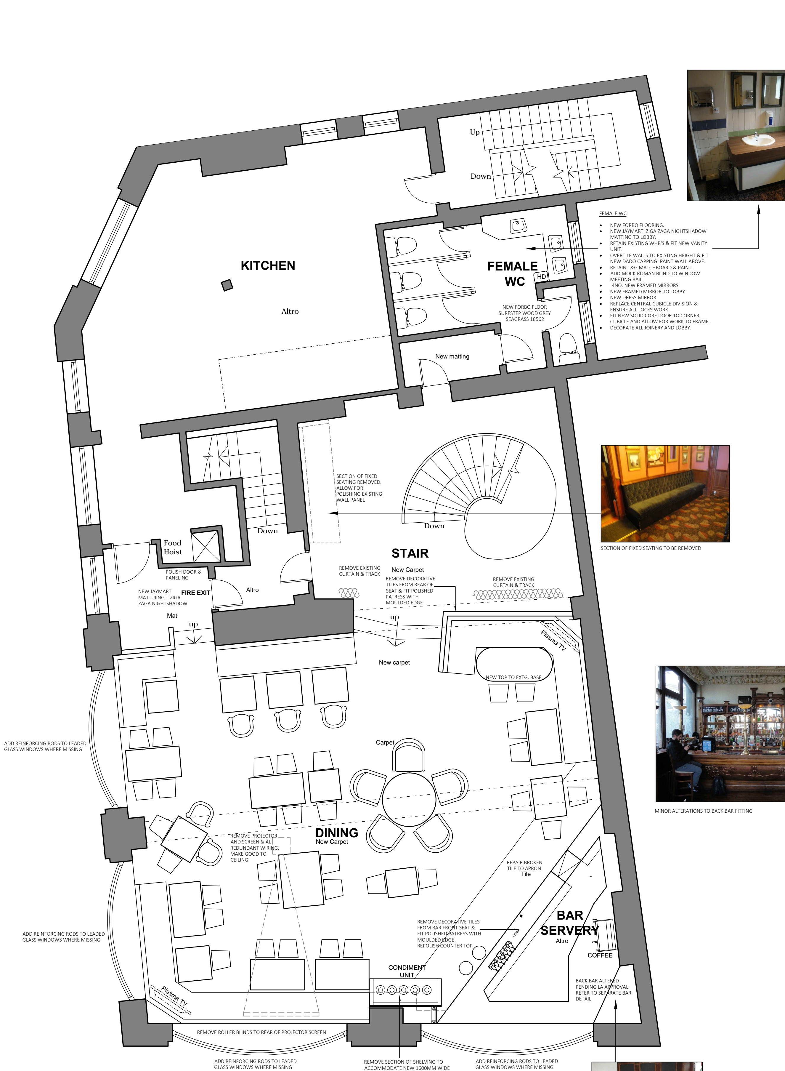
FIRST FLOOR PLAN AS PROPOSED 1:50